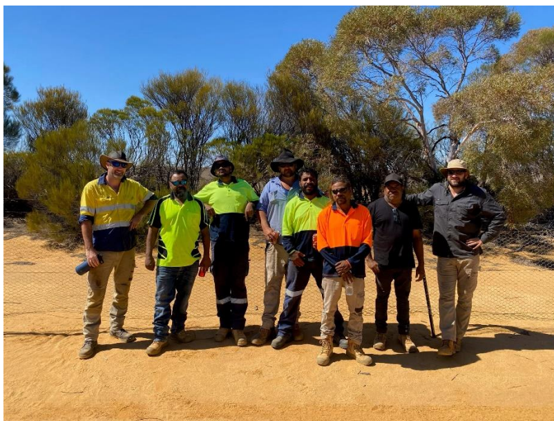
Badimia and BPM