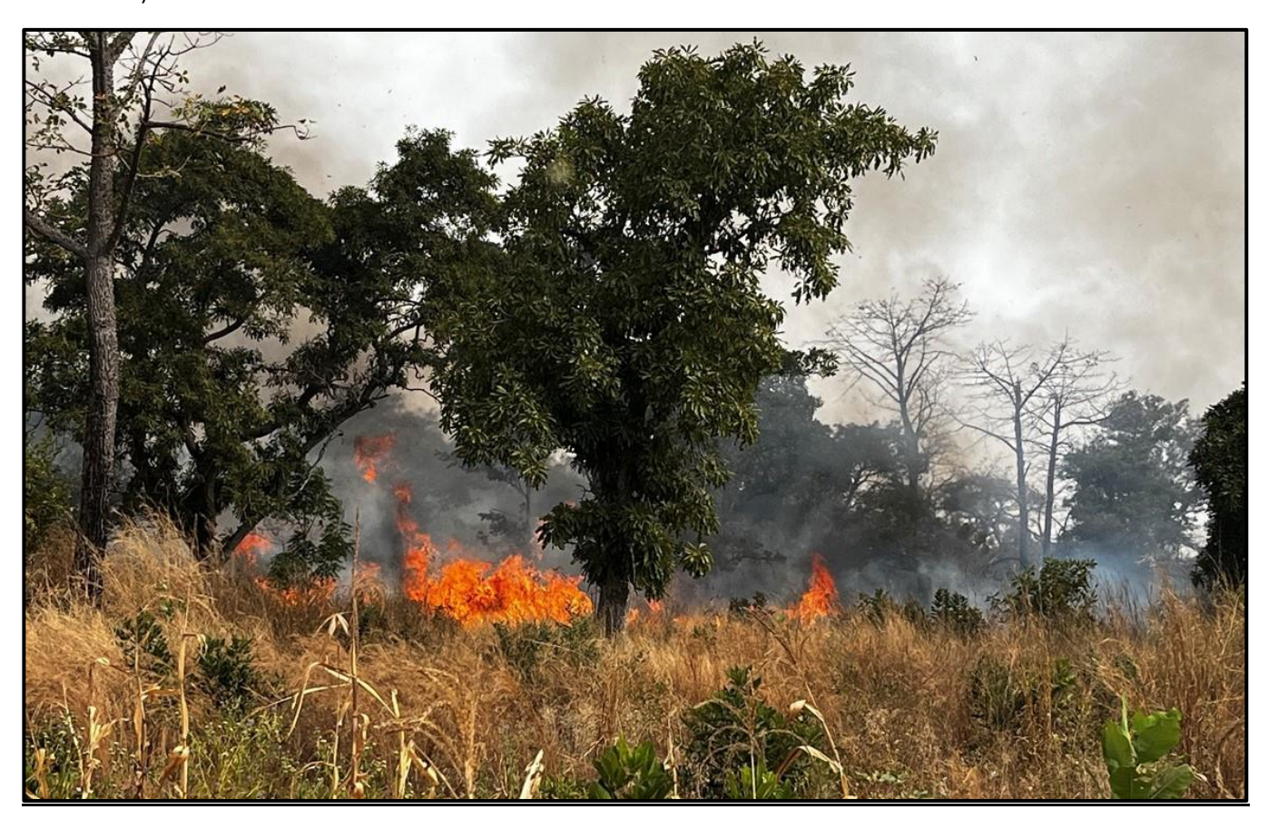
Figure 2: Example of annual grass fires at Diobi, December 16, 2023

The permit scale geochemistry survey, already covering 72% of the permit, will resume in early January, when the seasonable burning of dried grass will be completed and allow for easy access by the field teams.