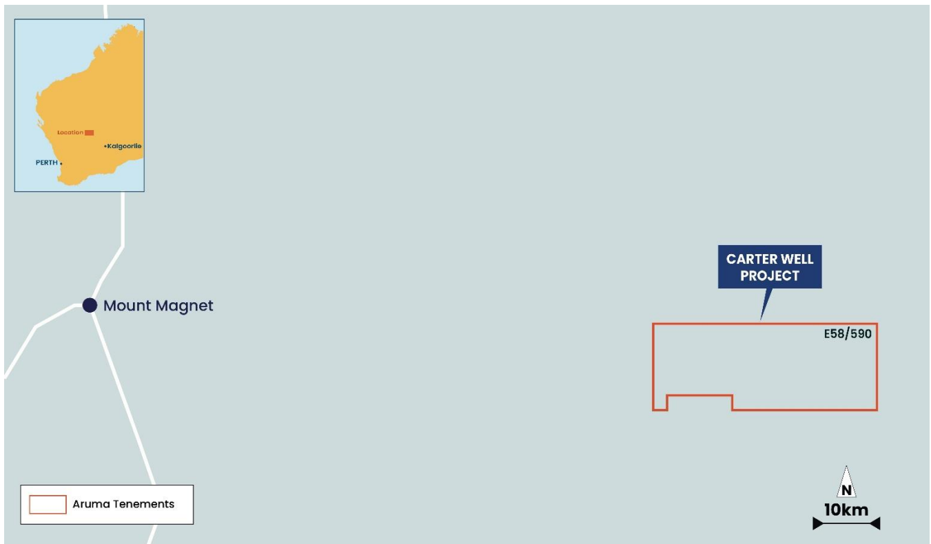
Figure 1. Carter Well Project location map.