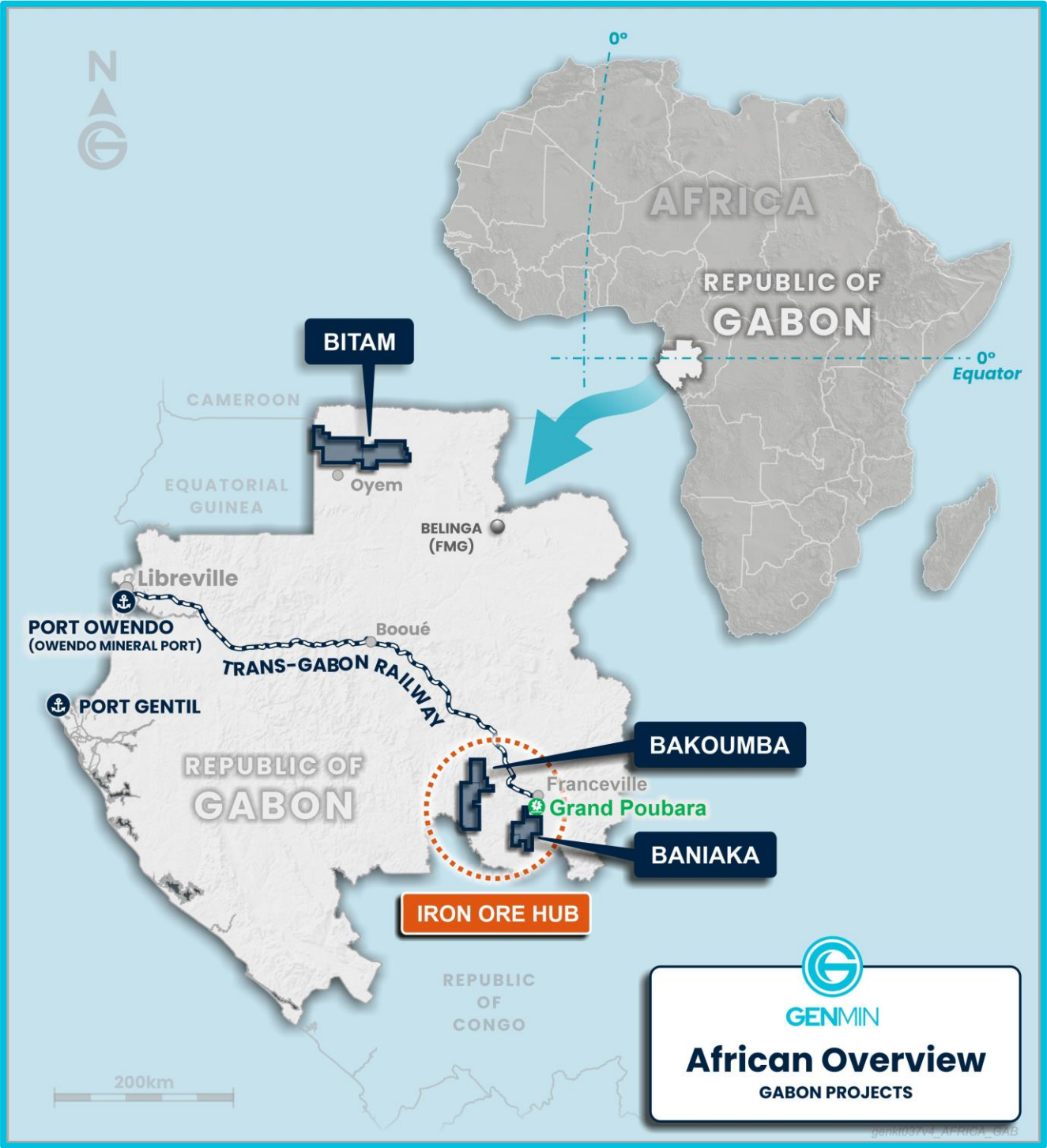
Figure 2: Map of Genmin’s projects in Gabon