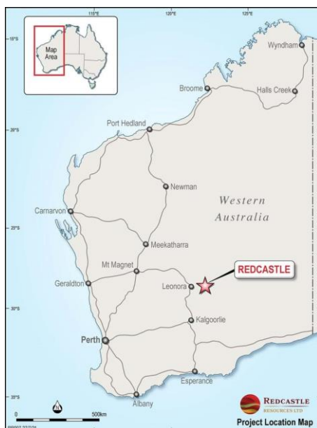
Figure 1: Redcastle Project - Location Plan

Redcastle Resources Limited ("RC1" or " The Company ") is pleased to announce the results of high-grade gold assays obtained from the single metre split samples selected from recently reported anomalous composited samples of the October 2023 RC drilling program at the Queen Alexandra ("QA") prospect, located within the Company's Redcastle Project Area.