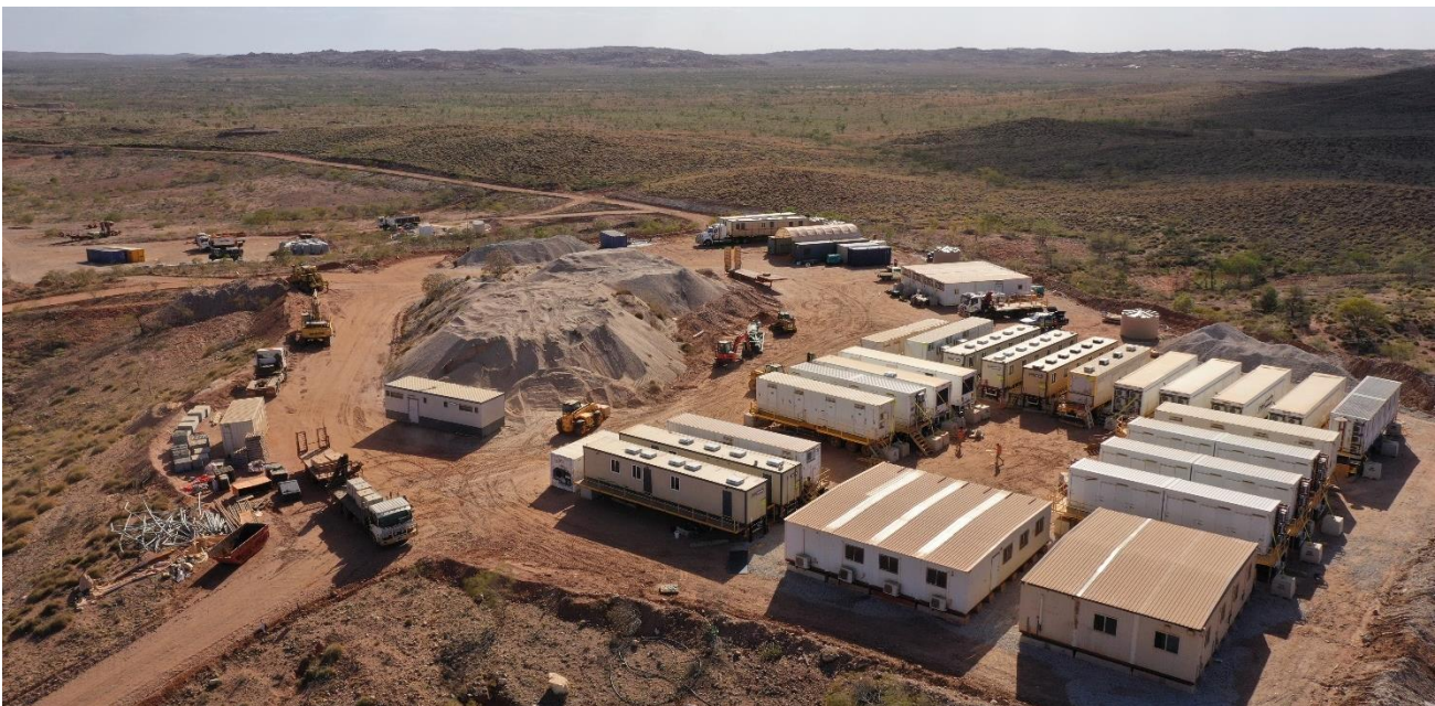
Figure 1 – Drone photo of the progress of the exploration camp expansion and earthworks to facilitate year-round drill access.

Australian lithium developer Wildcat Resources Limited (ASX: WC8) ("Wildcat" or the "Company") is pleased to announce the commencement of exploration activities for 2024 at its Tabba Tabba Lithium Project , near Port Hedland, WA.