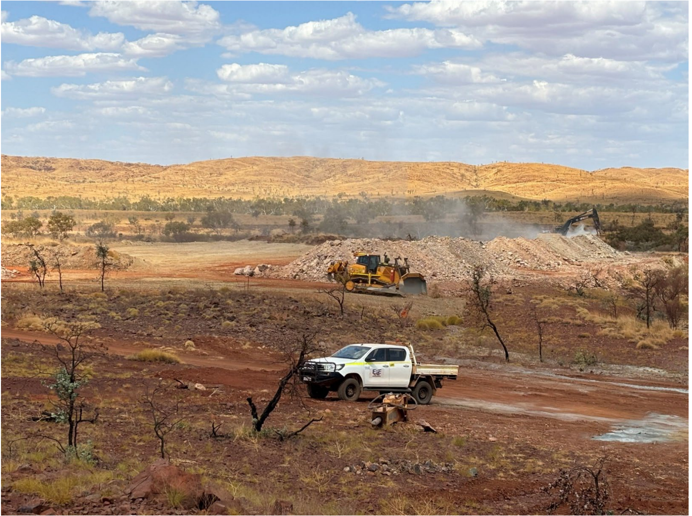
Figure 1: Historic stockpiles and ROM pad works at Blue Bar