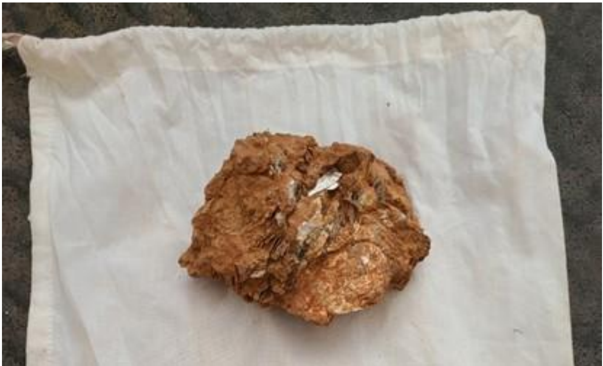
Figures 2 & 3. Field mapping has identified numerous pegmatite dyke swarms throughout the tenement. Further field investigations will focus on areas of highest soil anomalism.