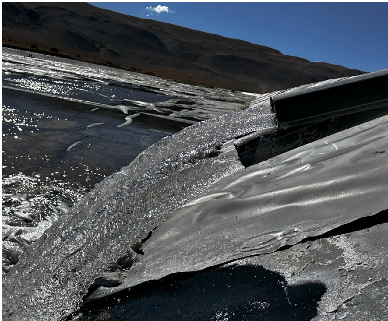
Filling of Pond 1 commences

As previously announced, the HMW project was separated into four production phases. The initial Phase 1 Definitive Feasibility Study (DFS) focused on the production of 5.4ktpa LCE of a lithium chloride concentrate by H1 2025, as governed by the approved production permits. The Phase 2 DFS targets 21ktpa LCE of a lithium chloride concentrate in 2026, followed by Phase 3 production of 40ktpa LCE by 2028 and finally a Phase 4 production target of 60ktpa LCE by 2030. Phase 4 will include lithium brine sourced from both HMW and Galan's other 100% owned project in Argentina, Candelas. The very positive Phase 2 DFS results were announced on 3 October 2023 ( https://wcsecure.weblink.com.au/pdf/GLN/02720109.pdf ).