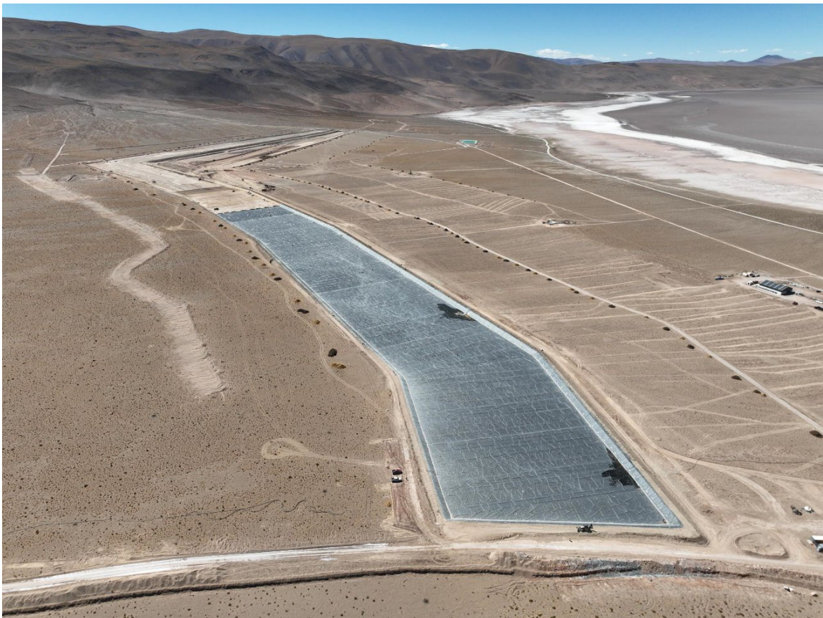
The overall progression of liner installation on Pond 1