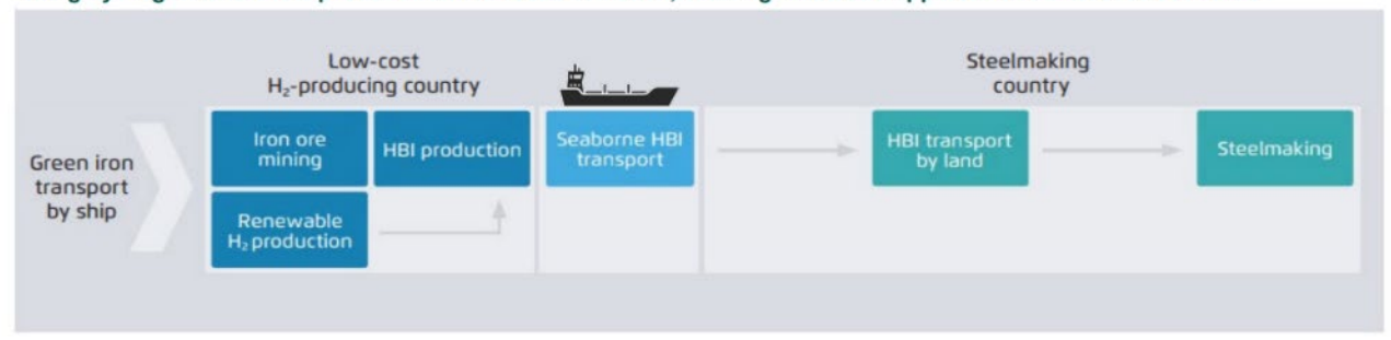
RESULT: Steelmaking countries are seeking locations where DR-grade iron ore co-exists with low-cost green hydrogen