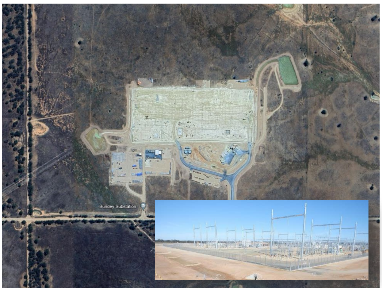
Figure 6. Bundey Substation under construction, near Robertstown SA.

Magnetite Mines continued its advocacy in support of ElectraNet's proposed Mid North Expansion (Northern) project, a conceptual plan to significantly expand South Australia's backbone transmission capacity from Bundey Substation to Cultana (near Whyalla) via Yunta. Such a project would provide new high-reliability grid connection options to the Braemar iron region. The December 2024 release of the Australian Energy Market Operator's draft 2024 Integrated System Plan confirmed that the Mid North Expansion (Northern) project was not proposed as an actionable project for the forward period.