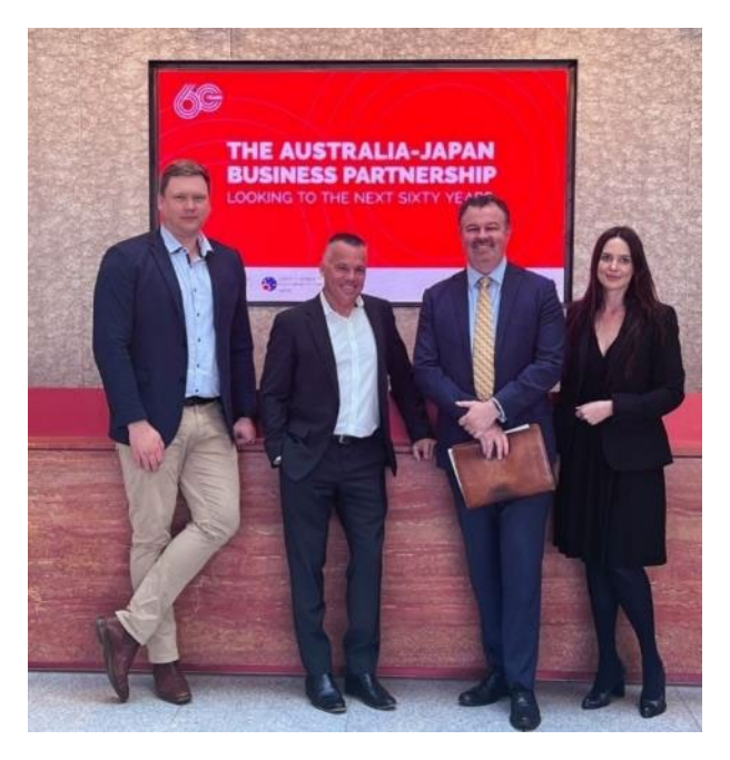
Figure 2. Magnetite Mines' executive team at the AJBCC conference, Melbourne - Oct 8-10, 2023

MGT management travelled to Saudi Arabia in early January for a series of meetings and to attend the Future Metals Forum in Riyadh, now one the largest and most important resources gatherings globally.