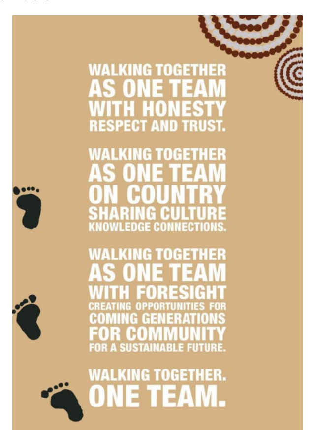
Figure 4. Ngadjuri Nation Aboriginal Council and Magnetite Mines Limited Partnering Statement

The Partnering Agreement aligns with Magnetite Mines' approach to sustainable development and commits both parties to cooperate on matters related to the development of the Razorback and Iron Peak mines, supporting infrastructure, future mines, exploration, land management, and economic and social development within Ngadjuri Country. The signing ceremony took place on Ngadjuri Country on December 20, 2023, attended by Magnetite Mines' staff, Ngadjuri Nation Board Directors, community members, and government officials.