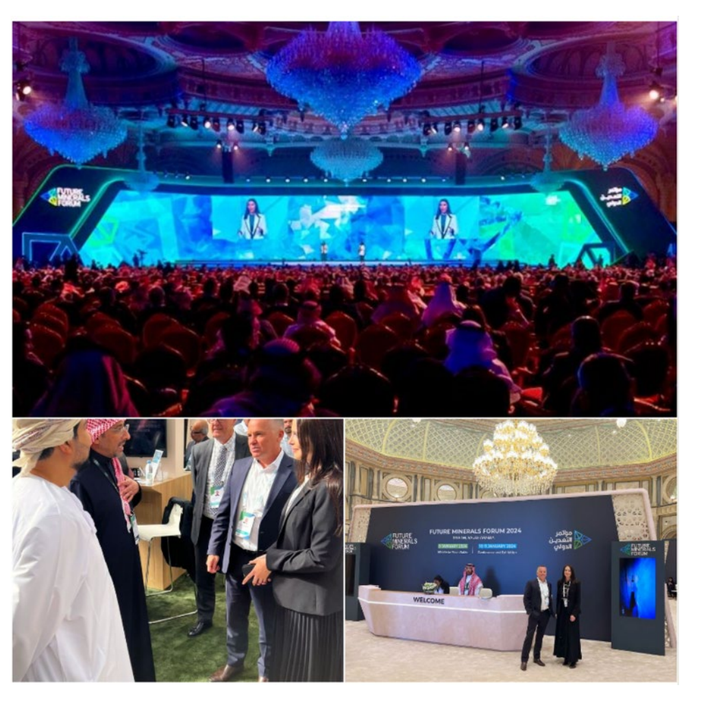
Figure 3. Magnetite Mines exhibited at the Future Minerals Forum, Riyadh – Jan 9-11, 2024

MGT management travelled to Saudi Arabia in early January for a series of meetings and to attend the Future Metals Forum in Riyadh, now one the largest and most important resources gatherings globally.