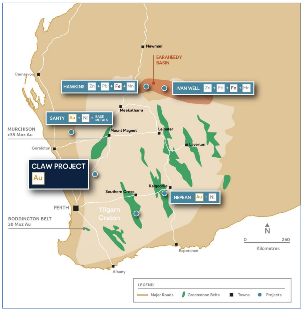
BPM Minerals Western Australian Precious and Base Metals Projects

The management and exploration teams are well supported by an experienced Board of Directors who have a strong record of funding and undertaking exploration activities which have resulted in the discovery of globally significant deposits both locally and internationally.