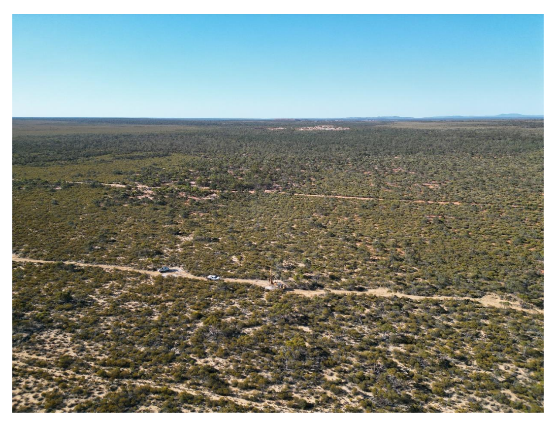
Figure 1 - Commencement of drilling immediately along strike of the Gunslinger gold discovery (located 500m north of the rig)