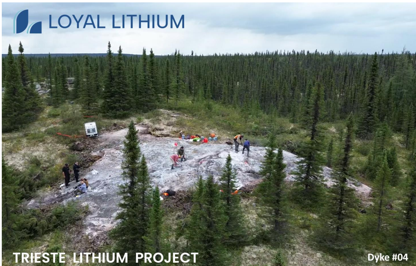
Image 2: Trieste Lithium Project – Dyke #04 drone image with geologists conducting channel sampling.