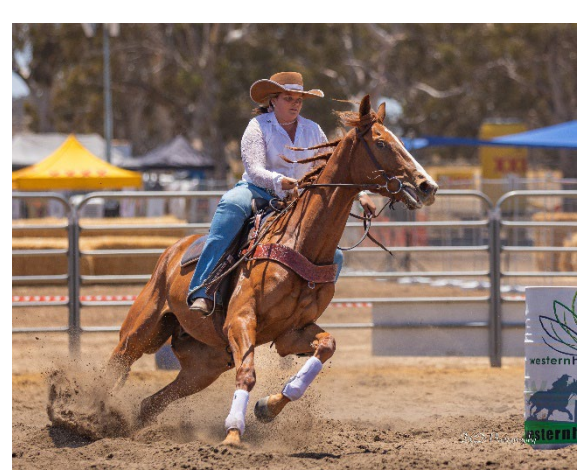
Figures 1 & 2: Mogumber Rodeo 2023 view of the competition arena and a Rodeo competitor