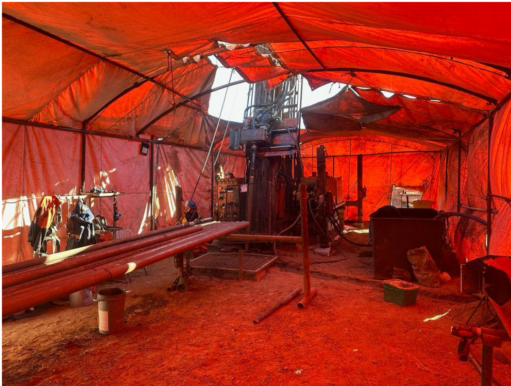
Figure 1 – Drilling commences at BNG Project under its winterised environment