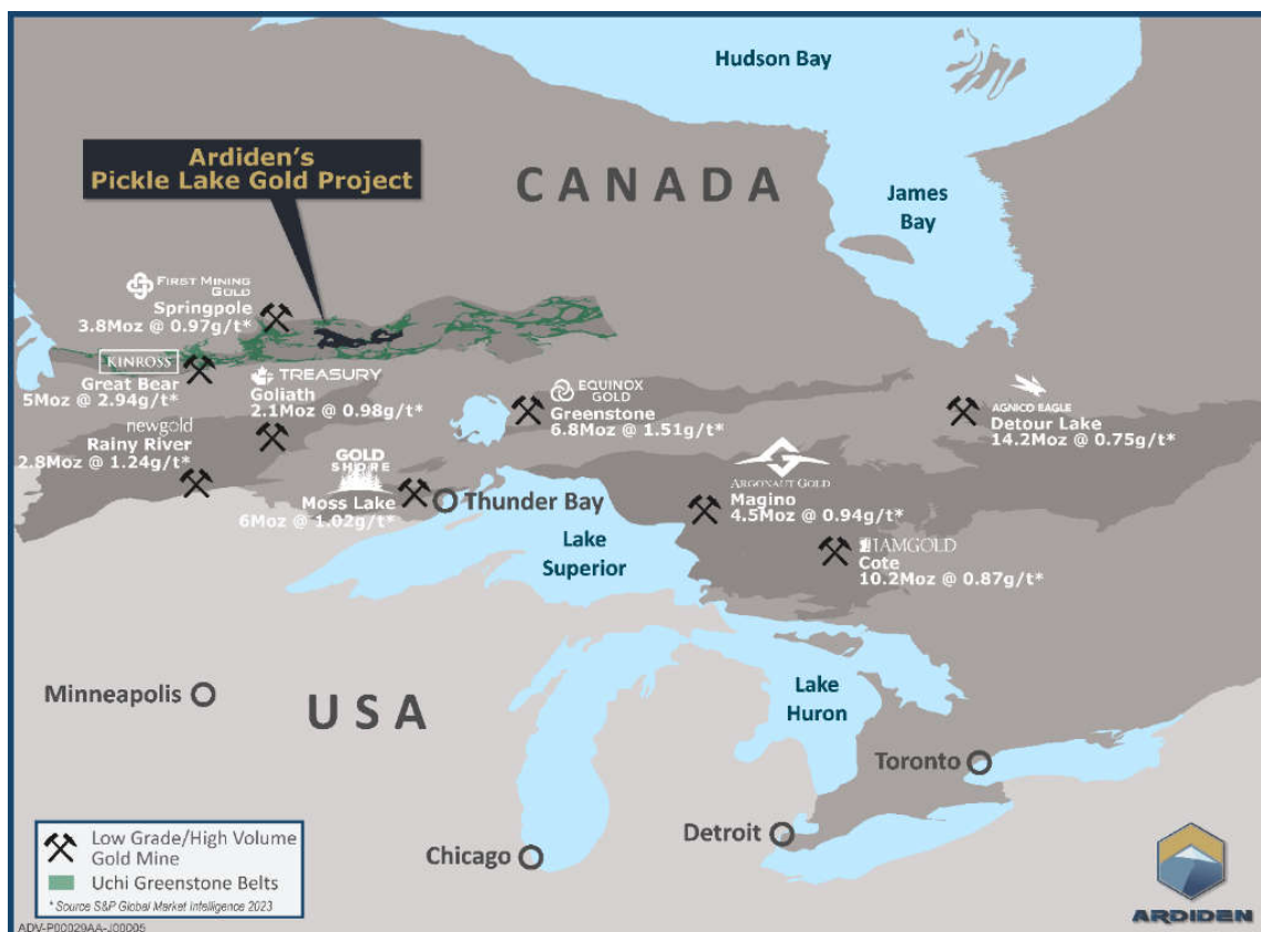
Figure 1– Location of Ardiden’s Pickle Lake Gold project within the Uchi Belt of northwest Ontario 1 .

Ardiden Limited (‘Ardiden’ or ‘the Company’) (ASX: ADV) is pleased to report on its Quarterly Activities at its highly prospective 100% owned Pickle Lake Gold Project in Northwest Ontario, Canada). Ardiden’s strategic landholding is situated on the same geological belt as Red Lake, the ‘Uchi’ Subprovince, which has produced over 30M oz of gold to date. (Figure 1).