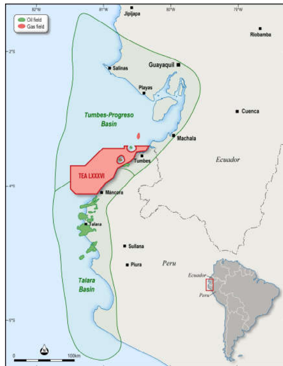
Figure 1 – Tumbes Basin TEA area in northern Peru.

Global Oil and Gas Limited (ASX: GLV) ( Global or Company ) is pleased to provide the following activities report for the quarter ending 31 December 2023.