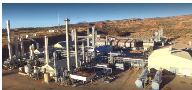
Figure 2: “5.5 Nines” Lisbon Valley Gas Processing Plant.

The Lisbon Plant is also currently sequestering carbon dioxide and is well advanced in the permitting process to qualify for carbon capture tax credits under Section 45Q (Revenue) of the US tax code. The recent Inflation Reduction Act increased the value of carbon dioxide sequestered to $85 per metric tonne, making it a potential material revenue stream for the Red Helium Project.