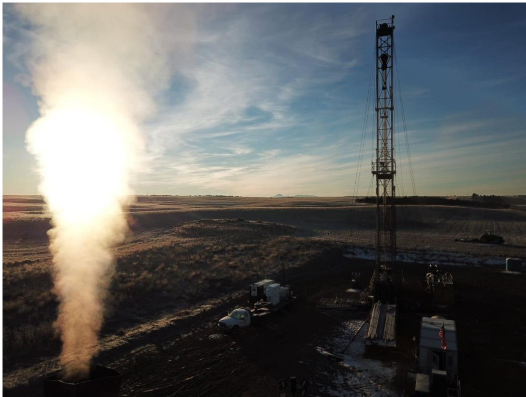
Figure 1: Jesse-1A flare-stack venting reservoir gas and helium to surface during flow-testing