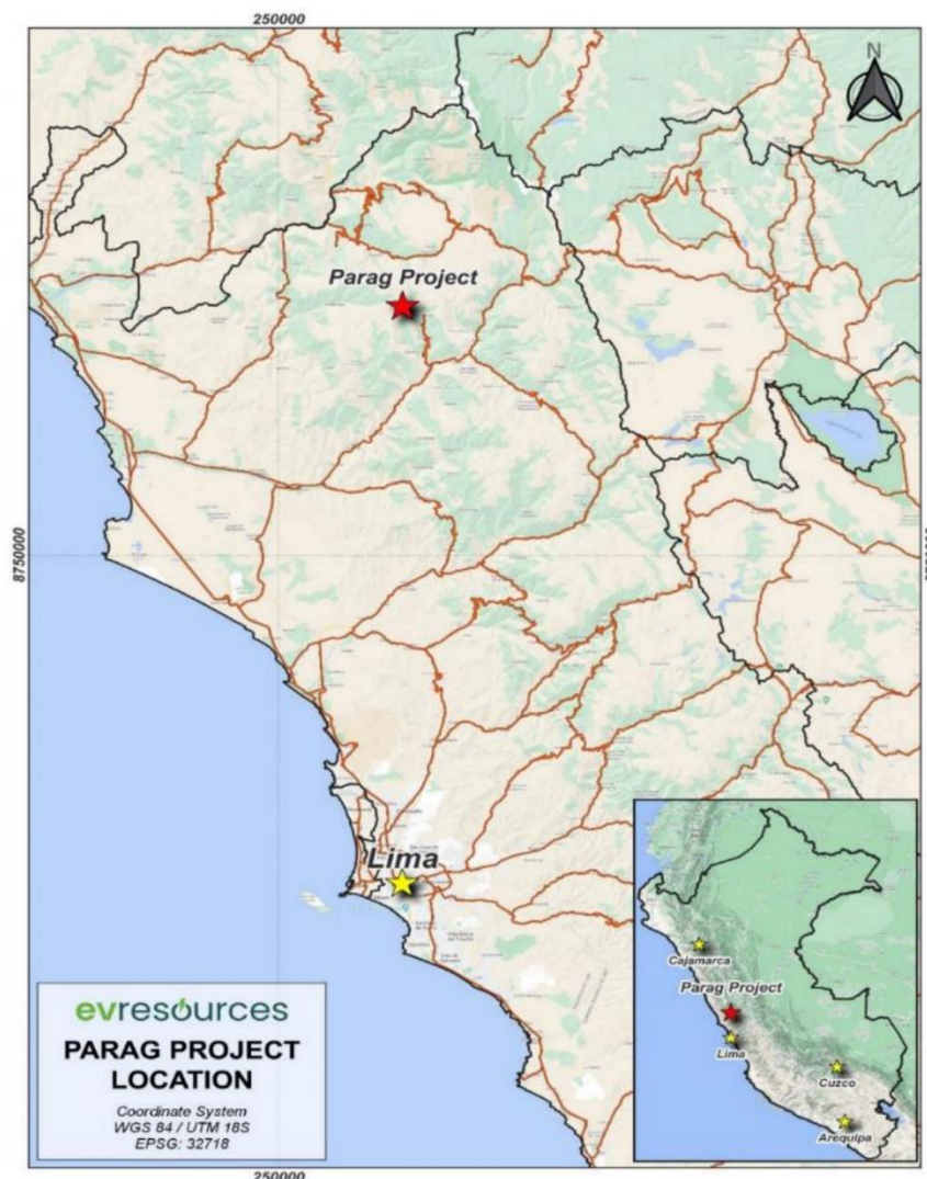
Figure 1: Parag Copper-Molybdenum Project Location

During the reporting period the Company achieved its objective of securing a drilling permit for the high grade Parag copper-molybdenum project located in Huauru province, Peru. This followed an extensive period of community engagement, and the conclusion of multi year land access, partnership and investment agreements with the communities of Caujul and Navan.