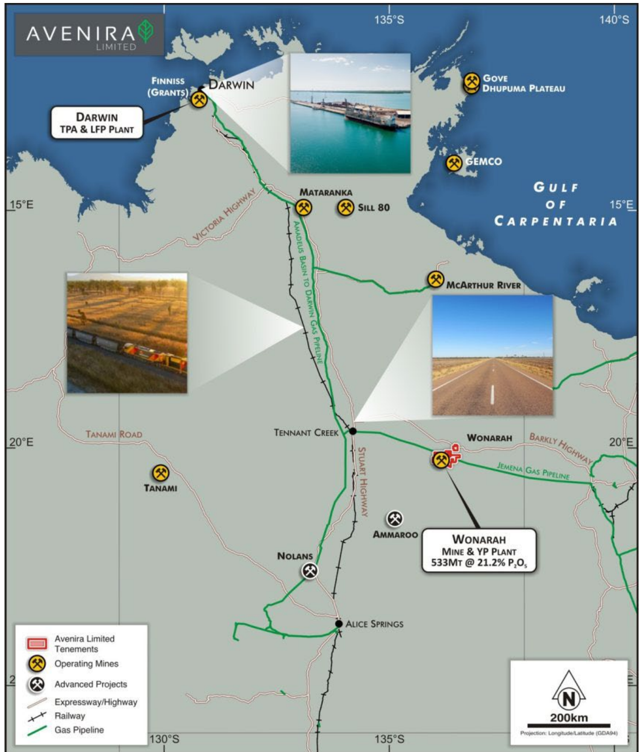
Figure 1. Wonarah Phosphate Project in the Northern Territory