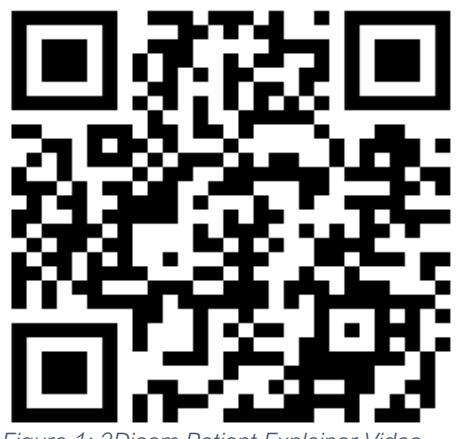
Figure 1: 3Dicom Patient Explainer Video

The Company is also pleased to inform shareholders that it has lodged a patent application to protect the key