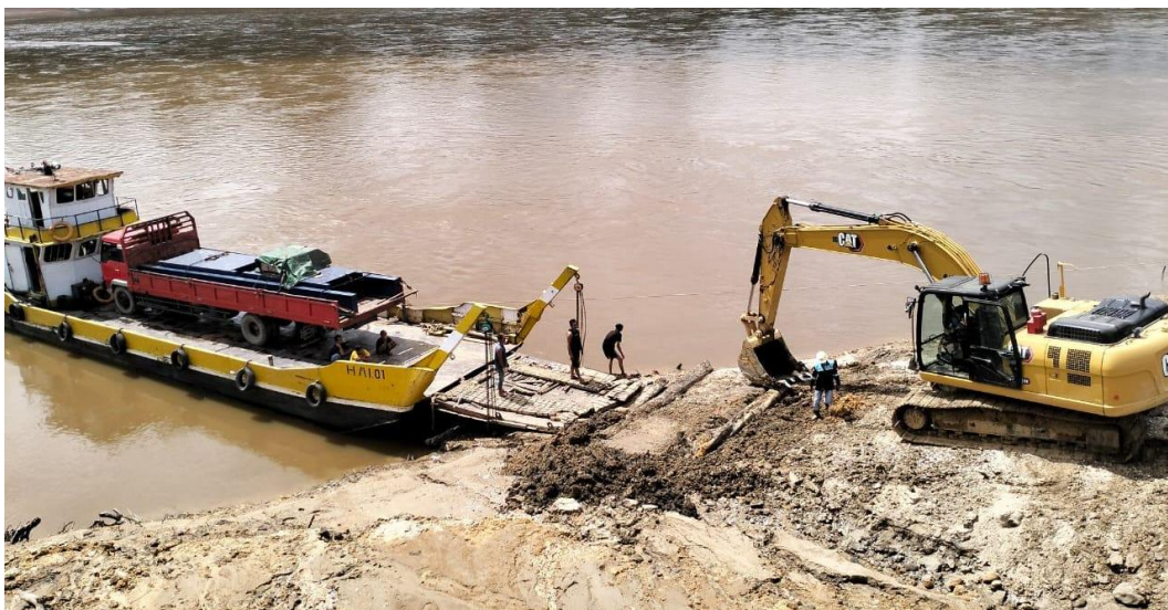
Weighbridge components being unloaded at Batu Tuhup Jetty