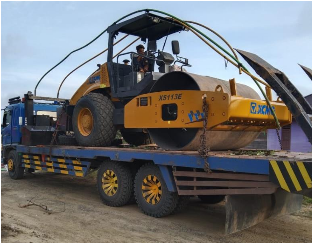
Compactor for Road development