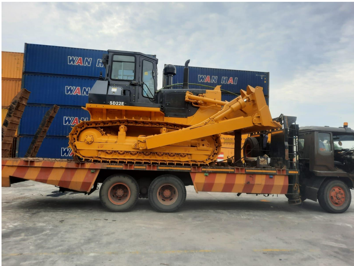
Bulldozer for Road development