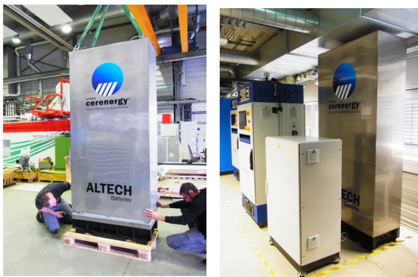
Figure 4: Delivery of the battery casing and heat loss testing at Fraunhofer IKTS Dresden

König Metall GmbH has produced and delivered two casings for the 60 kWh battery houses. Fraunhofer IKTS, situated in Dresden, will furnish the testing racks for charge and discharge cycling to assess the battery performance. Simultaneously, the battery housings are undergoing heating cycles to evaluate the heat loss parameters of the vacuum-insulated casings. Specialised software has been developed to facilitate access to the parameters that the CERENERGY® BatteryPack will furnish during testing. The assembly of cells into the battery housing will be undertaken once all cells are finalised and is expected by the middle of 2024.