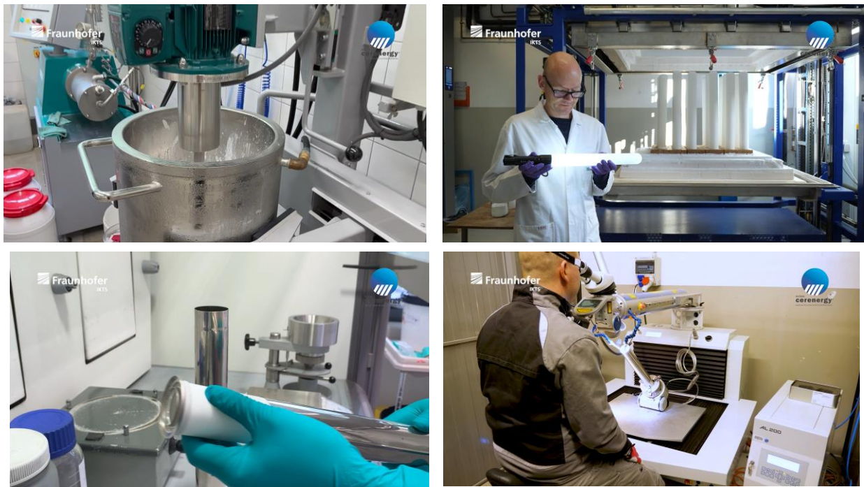
Figure 2 – Production of battery cells at Fraunhofer IKTS Hermsdorf pilot plant facility

All prototype materials have now been procured from specific suppliers. The crucial stages in cell production involve blending ceramic components, high-pressure pressing, tube formation, and ultimately sintering at 1,600 degrees celsius over a span of several days. Fraunhofer IKTS' Hermsdorf pilot plant facility successfully navigated the entire ceramic tube production, with half of the required tubes now manufactured. The battery cathode electrolyte, comprising sodium chloride and nickel powder granules, was produced using the mixing and pelletising equipment at the Hermsdorf pilot plant. The process of cell assembly, encompassing vacuum filling, heating, and welding, is ongoing, resulting in the completion of approximately half of the cells. To facilitate the infiltration of cathode material into multiple battery cells simultaneously, a vacuum chamber was developed. Promising pass results were obtained from laser welding tests on the battery cells conducted at Precitec GmbH & Co. KG