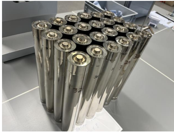
Figure 3 – Some of the completed battery cells waiting performance testing