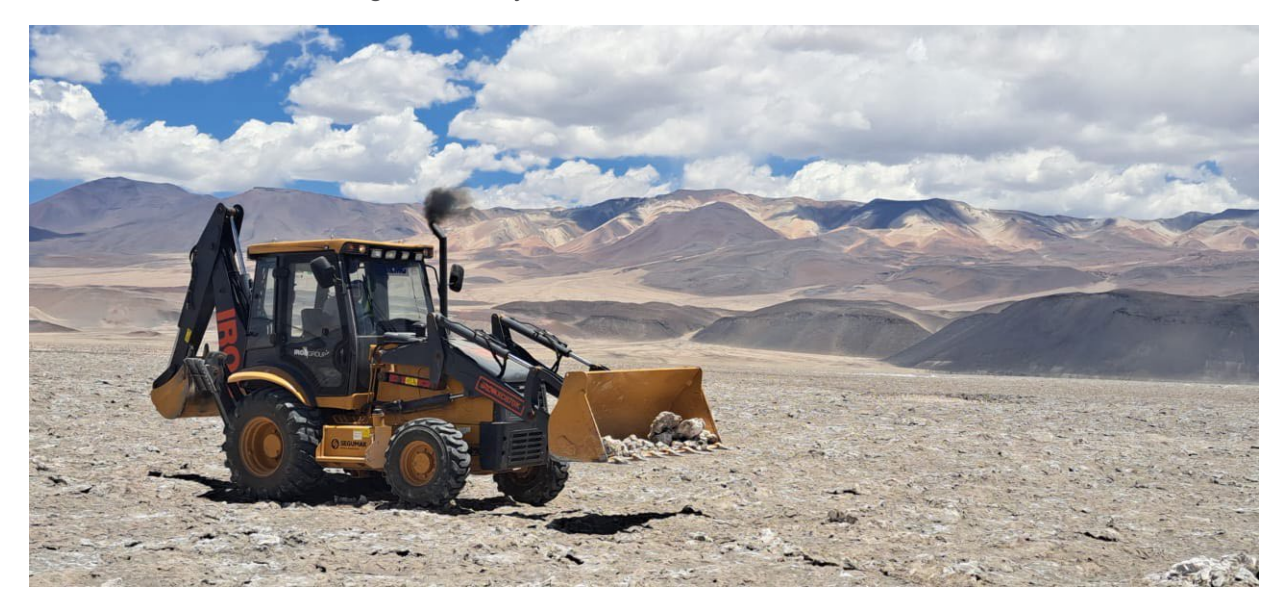
Figure 1 – Front end loader preparing roads and drilling platforms at the Rio Grande Sur Project in Salta, Argentina.

The initial phase of the drilling programme has now commenced on site at the Rio Grande Sur Project with earthworks and mobilisation of rigs underway.