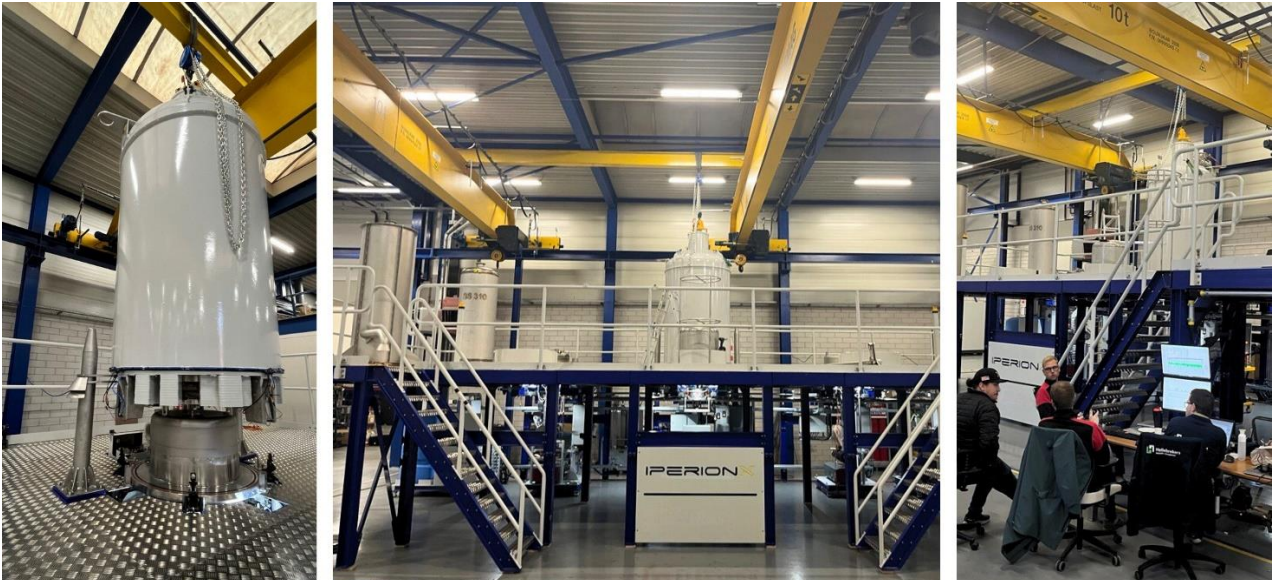
Figure 1: IperionX's HAMR Furnace, the heart of the Titanium Production Facility

A critical IperionX production asset, this large-scale, industrial titanium furnace leverages patented company technologies, such as HAMR 1 and HSPT 2 , to produce sustainable, high-quality and high-strength titanium metal products at commercial scale. This first production milestone will combine leading innovation and sustainability to set new industry standards in titanium metal production.