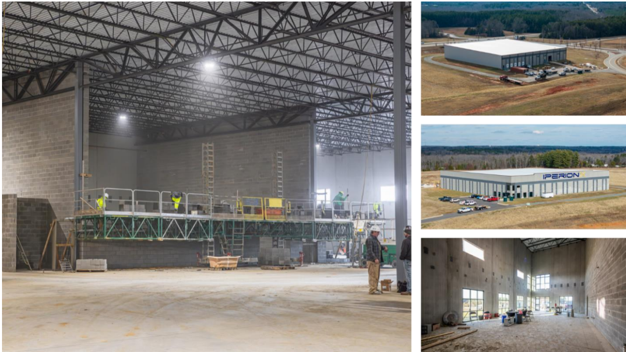
Figure 2: Construction activities at the Titanium Production Facility

Construction of the Titanium Production Facility is advancing to schedule, with the HAMR titanium furnace expected to be commissioned and to produce first titanium metal in mid-2024.