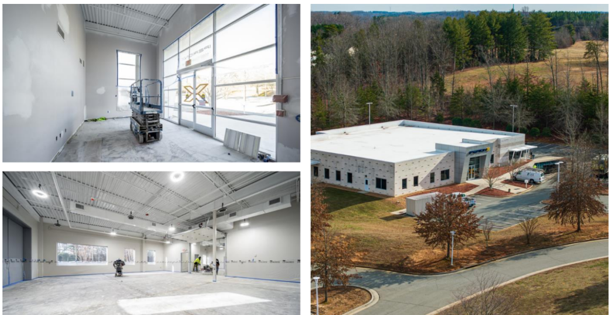
Figure 3: IperionX's Advanced Manufacturing Center

Construction of the Advanced Manufacturing Center is on-schedule and anticipated to be commissioned during the second quarter of 2024. This advanced manufacturing unit will utilize angular and spherical titanium powders from the Titanium Production Facility to manufacture a wide range of low-cost and high-performance titanium products using powder metallurgy, HSPT forging and additive manufacturing/3D printing. It will also leverage CNC machining, post-processing equipment and advanced R&D laboratories to support customer and government engagement.