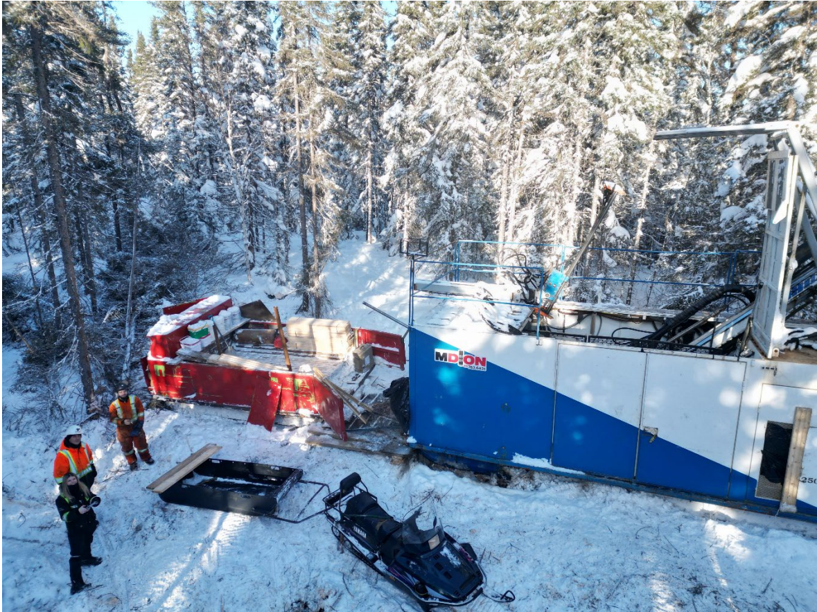
Figure 1: Forage Mdion diamond drill rig on location at the Z-dyke Cadillac Lithium Project, Quebec