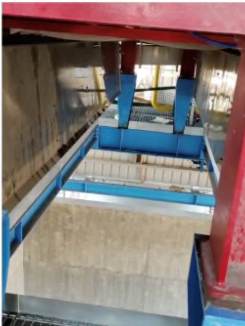
Images: Concentrate Cake Discharged From Filter Press

Hot commissioning of the plant began early February with basaltic rock feed to the crusher with onward conveyance to the grinding circuit through SAG and ball mills, followed by cyclonic movement to the downstream flotation circuit. Through adjustment of the dart valves in the flotation circuits concentrate and tailings were generated at different times and both the concentrate and tailing dewatering circuits were tested with a full load of materials. The flotation cells were fed with blower air. The entire operation is being now being carried out remotely through programmable logic controllers (PLCs).