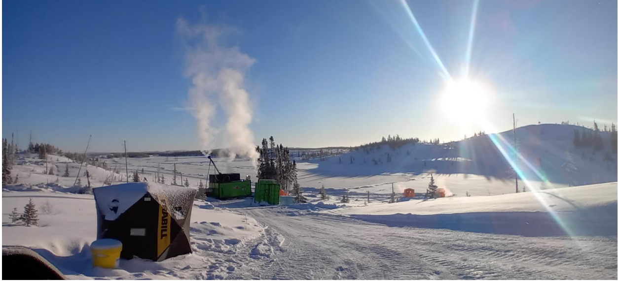
Figure 4: Road access to drill hole CV24-380 at the CV5 Spodumene Pegmatite.