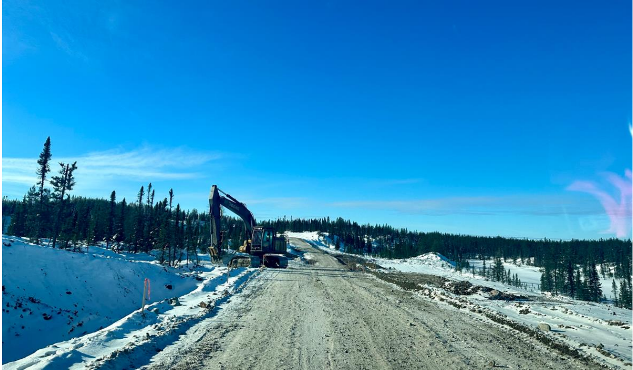
Figure 5: Portion of all-season road, constructed by the Company, extending south from Shaakichiuwaan Camp, at KM-270 of the Trans-Taiga Road, to the CV5 Spodumene Pegmatite.