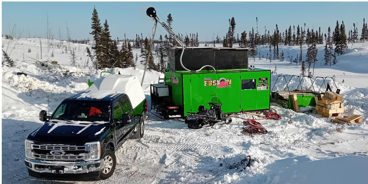
Figure 3: Road access to drill hole CV24-378 at the CV5 Spodumene Pegmatite.

In addition to the camp and road infrastructure development, the Company anticipates completing a geomechanical drill program this winter at CV5. Data from this drilling and sampling will provide key datapoints to assess pit slope stability and design. This work will be followed in the summer by an infrastructure and condemnation geotechnical drill program, which will include potential tailings and waste rock storage sites, process plant, and camp accommodations for operation. A phase II hydrogeological drill program at CV5 is also planned for the summer, which will build upon the preliminary hydrogeological model completed in 2023.