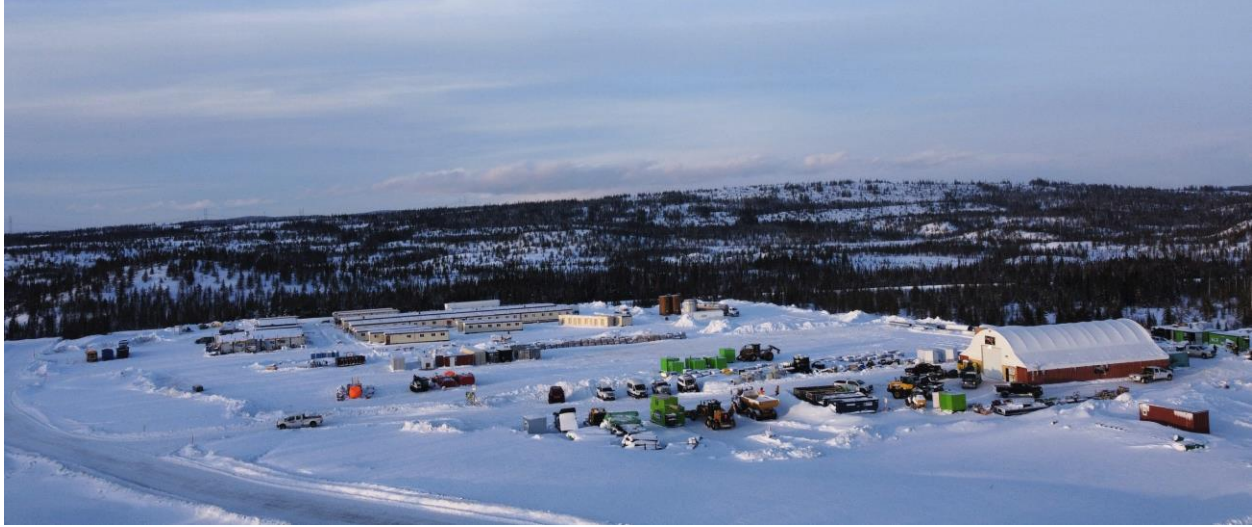
Figure 6: Shaakichiuwaan exploration camp constructed by the Company at KM-270 of the Trans-Taiga Road (January 2024).