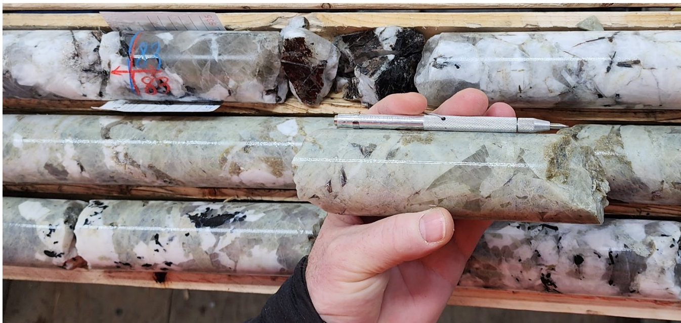
Figure 1: Up to 70% estimated spodumene mineralisation over 3.3m in DDH1557-24-041.

Recent diamond drilling has confirmed Pegasus as a large continuous pegmatite body which is up to 76.6m in width (true width) which has now been defined over 300m of strike and remains open. Drilling has returned multiple shallow +40m spodumene-bearing pegmatite intersections with an average width of 38m (true width), most of which are within 100m of surface. This includes the best visually observed estimated mineralised intersection to date in DDH1557-24-041 of 43.7m of pegmatite with 10-12% spodumene mineralisation from 46.4m, including 3.3m with 60-70% spodumene mineralisation from 83.5m.