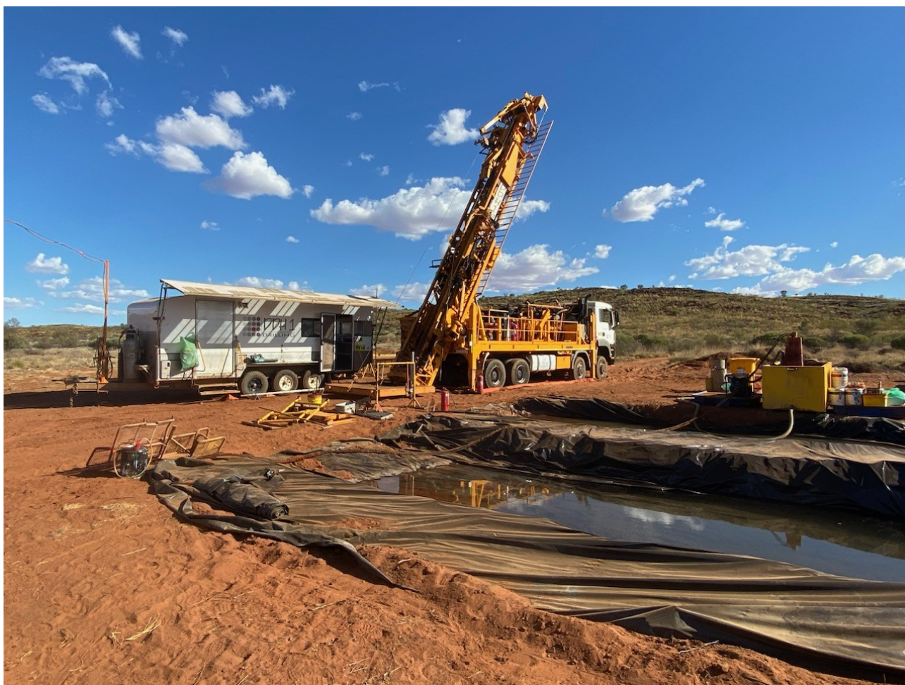
Image: Diamond drill rig set-up and ready to start the first hole, WADD001, at Pokali North.