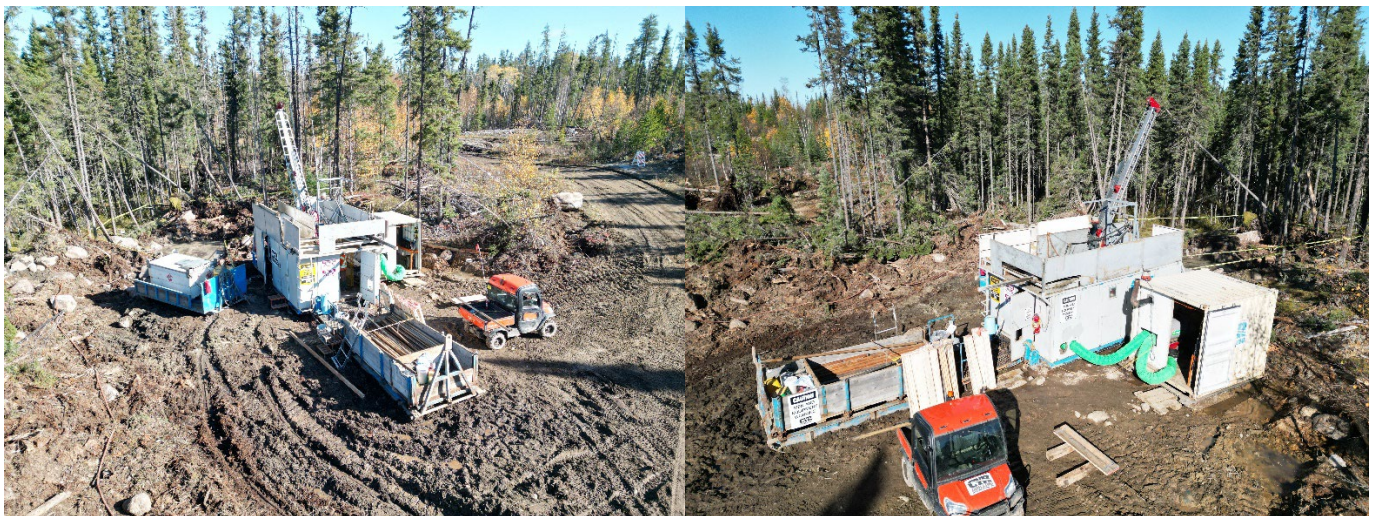
Figure 1: Diamond Drill Rigs located at the Seymour Lithium Project