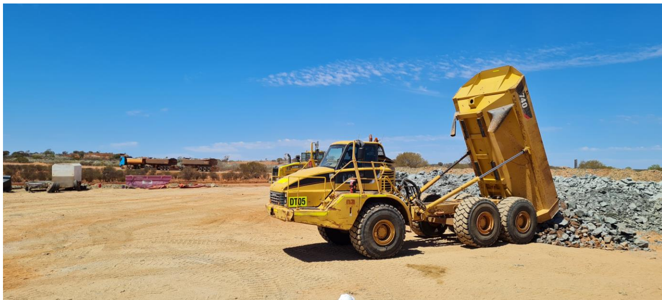
Figure 2 - Last ore load being dumped on Selkirk ROM

This ASX announcement has been approved by the Managing Director on behalf of the board of Brightstar.