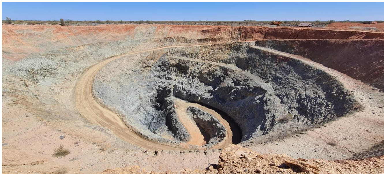
Figure 1 – Selkirk Pit (looking NW) upon completion

We look forward to sharing news of Brightstar's inaugural gold pour in March and further activities related to our Pre-Feasibility Study as they occur, including an RC program to commence at Menzies in the near future".