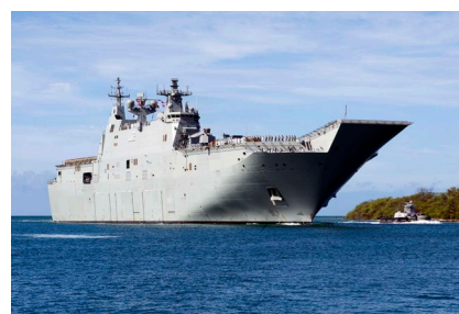
LHD HMAS Canberra