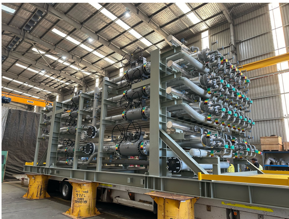
CO2 removal membrane package in partnership with SLB

“Heading into the second half of FY24 our focus continues to be on consistent EBIT generation and we look forward to the conclusion of numerous tendering opportunities and announcing new awards.”