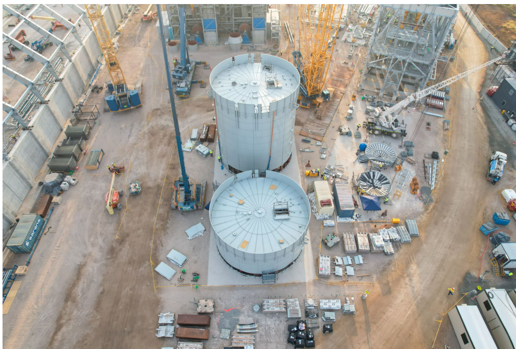
Kwinana Cockburn Cement Upgrade - performed by SIMPEC under a LNTP

“The encouraging expansion of our East Coast team signifies not only current growth but also offers significant potential for further development. Aligning proudly and forming partnerships with Tier 1 Clients across various sectors throughout Australia, SIMPEC positions itself for noteworthy achievements in the forthcoming financial year. The outlook is optimistic, reflecting the anticipation of a highly successful period for the SIMPEC business.”