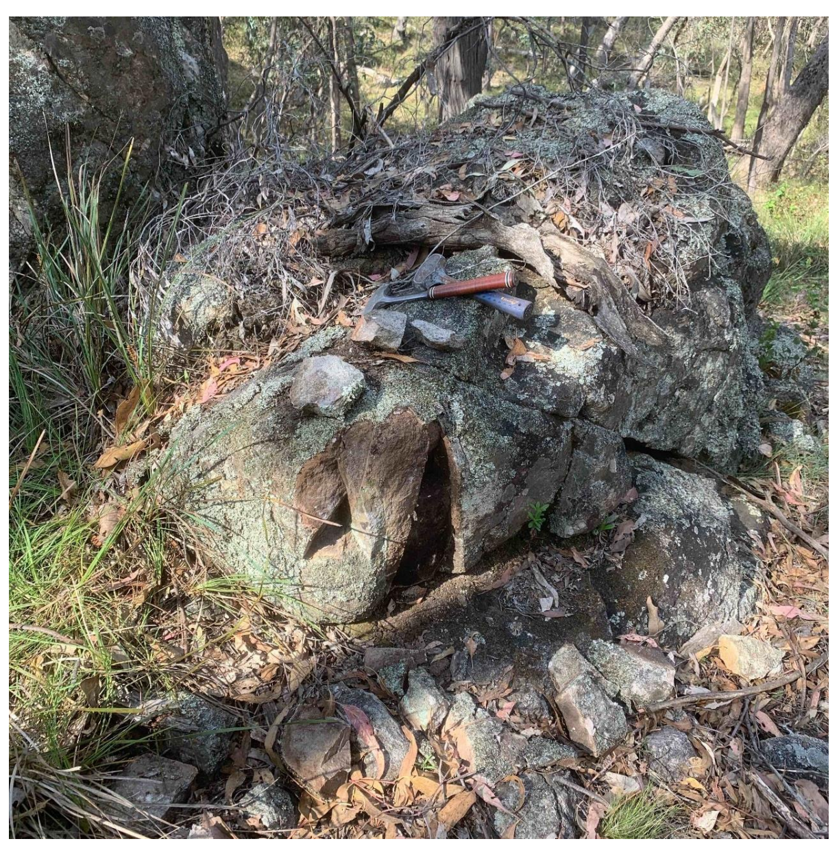
Figure 1. The Giant Pegmatite Outcrop

At Sweetwater Station, results from our first ever soil sampling program are eagerly awaited. The Sweetwater area contains what is colloquially known as the "Giant Pegmatite" which is targeted for follow up work once approvals are in place. The results from the soils program are expected to be available during Q2 2024".