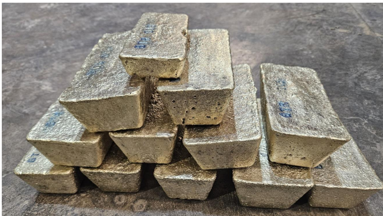
Figure 1 - Gold doré bars (BTR005 – BTR016) poured on 9 March 2024

Brightstar Resources Limited (ASX: BTR) ( Brightstar ) is pleased to announce that following on from the maiden gold pour announced 07/03/2024 1 , a second highly successful gold pour has occurred at Genesis Minerals' Gwalia processing plant as shown in Figure 1 below.