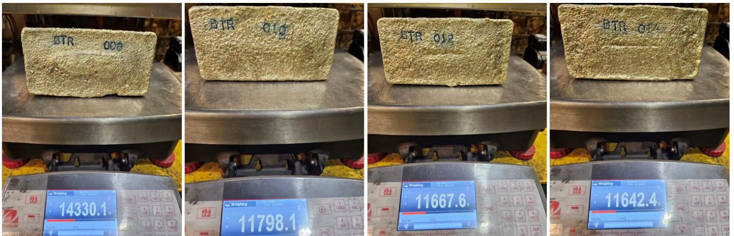
Figure 2 – Example weights of gold doré bars BTR008, BTR010, BTR012, BTR014

As shown in Figure 1, twelve gold doré bars were poured for a total mass of 119kg. Processing of the Selkirk ore remains ongoing and we look forward to updating our shareholders and investors with finalised cashflow updates once all revenue has been received from the Perth Mint after refining of the doré bars and joint venture project costs have been finalised."