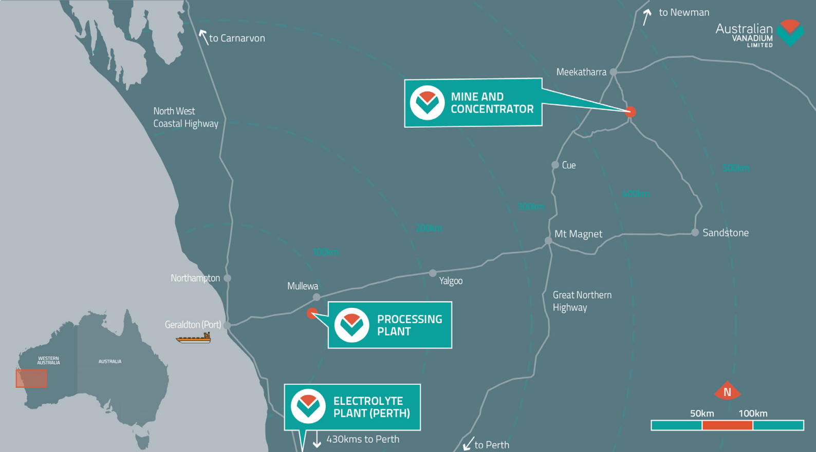
Figure 1 – Location of The Australian Vanadium Project