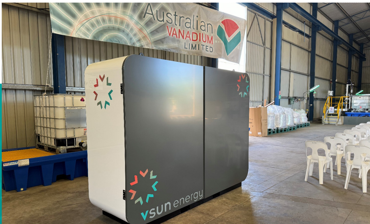
Figure 2 – Prototype residential VFB

AVL will continue to consider all options to maximise shareholder value for the non-core Coates Nickel-Copper-PGE and Nowthanna Hill Uranium projects.