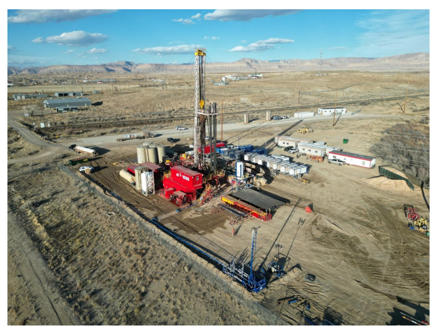
Figure 1: The drill rig setup at the Bosydaba#1 well site with the Sample Demonstration Plant in the background.

The majority of the water-yielding rock units in the area are part of either an upper or lower hydrologic system. The two systems are separated by the impermeable salt beds of the Pennsylvanian Paradox Formation, which underlies the counties in the region (Weir, Maxwell & Zimmerman, 1983) which is further supported by the salinity values intersected in this "surface" drilling just completed by Anson.