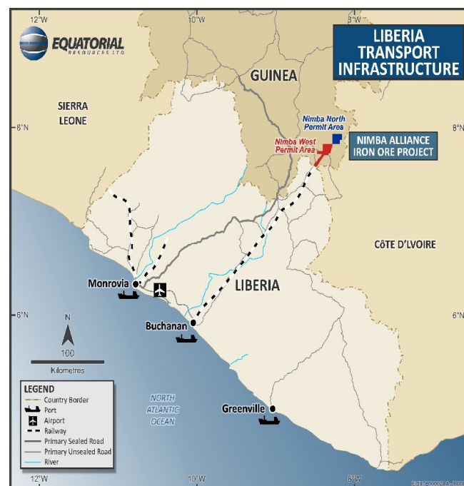
Figure 2 – Liberian Transport Corridor