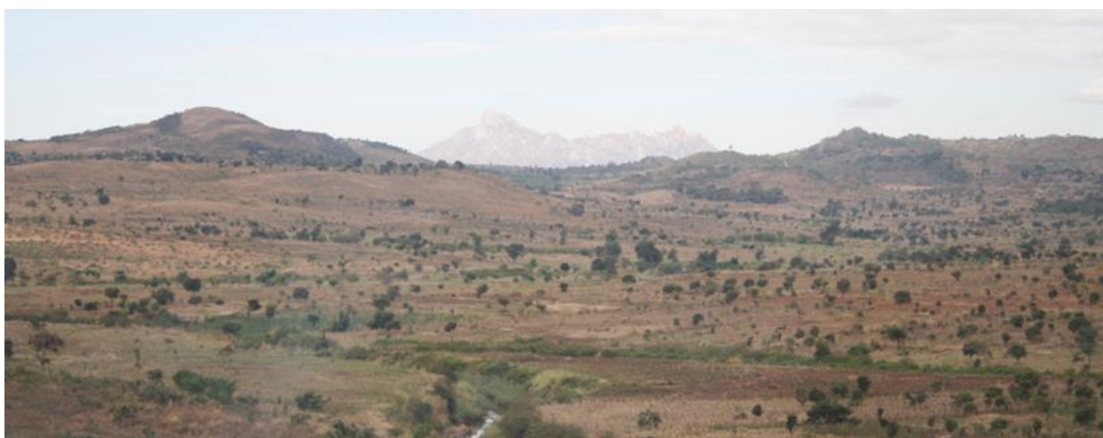
Figure 2: Looking East towards the Duwi Natural Graphite Project Site.