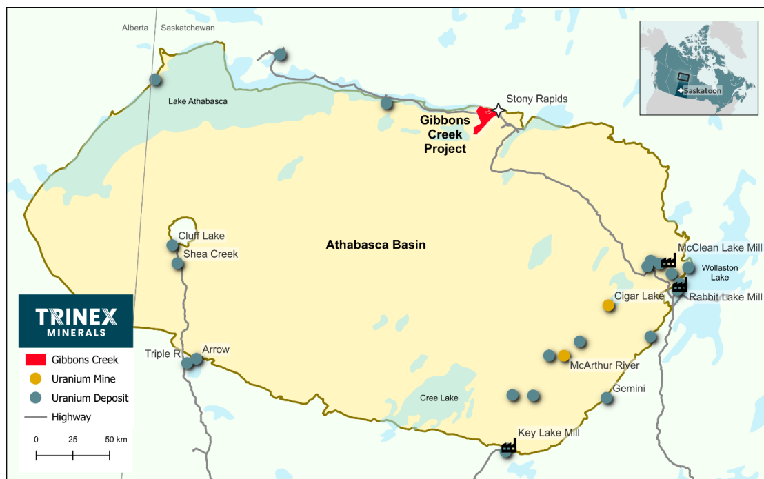
Figure 1 – Athabasca Basin showing the location of the Gibbons Creek Uranium Project and existing uranium mines and deposits.

A comprehensive review of Gibbons Creek historical exploration data was carried out by ALX and has integrated that information with the high-resolution magnetic and SGH geochemical surveys completed in November 2023. The historical data and the results of ground surveys carried out by ALX on the 2023 exploration grid show important characteristics of the Project's potential to host uranium mineralisation. This is demonstrated by the mineralisation found in ALX's 2015 drillhole GC15-03 (0.13% U_3O_8 over 0.23 metres from 107.67 metres to 107.90 metres) and in Eldorado Nuclear's 1979 drillhole GC-15 (0.179% U_3O_8 over 0.13 metres from 134.11 to 134.24 metres) (see Figure 2).