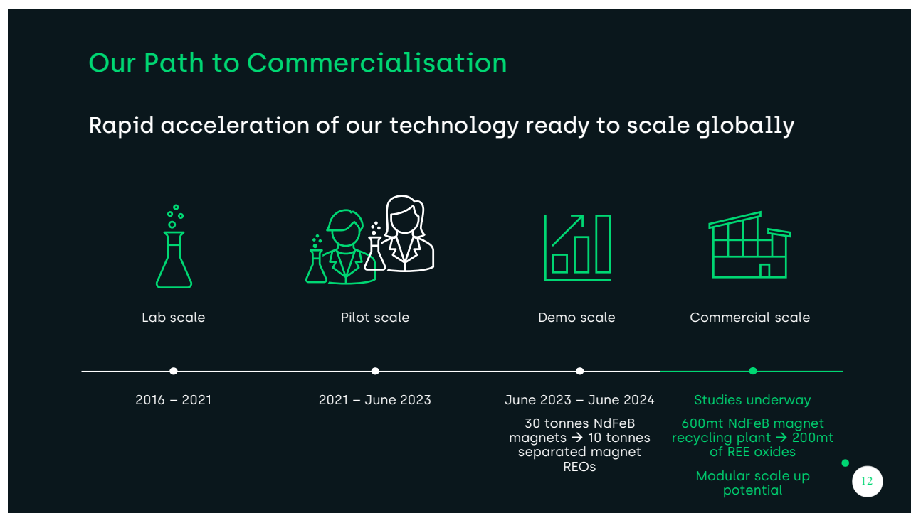
Figure 10: Ionic Technologies path to production.