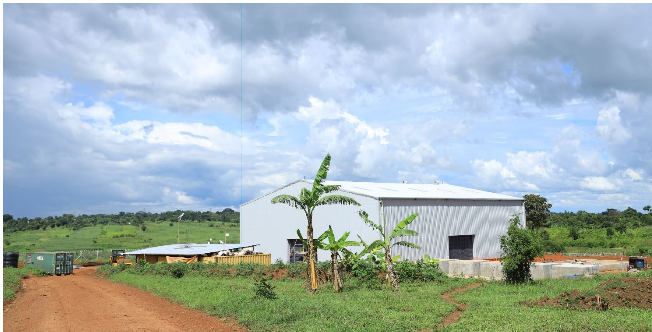
Figure 4: Makuutu Stage 1 Demonstration Plant.