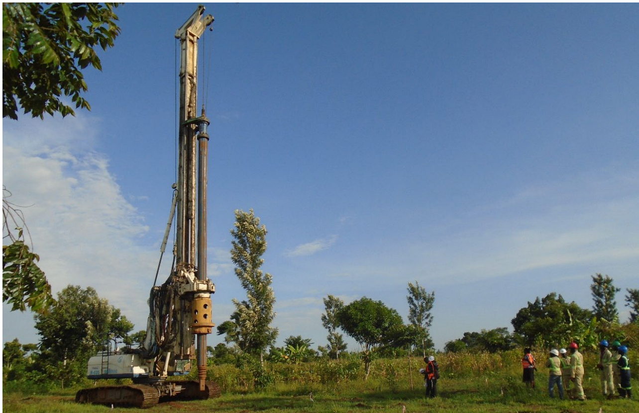
Figure 6: Auger drill mobilised to test site to collect bulk sample test material for the initial Phase 1 test program at Makuutu.