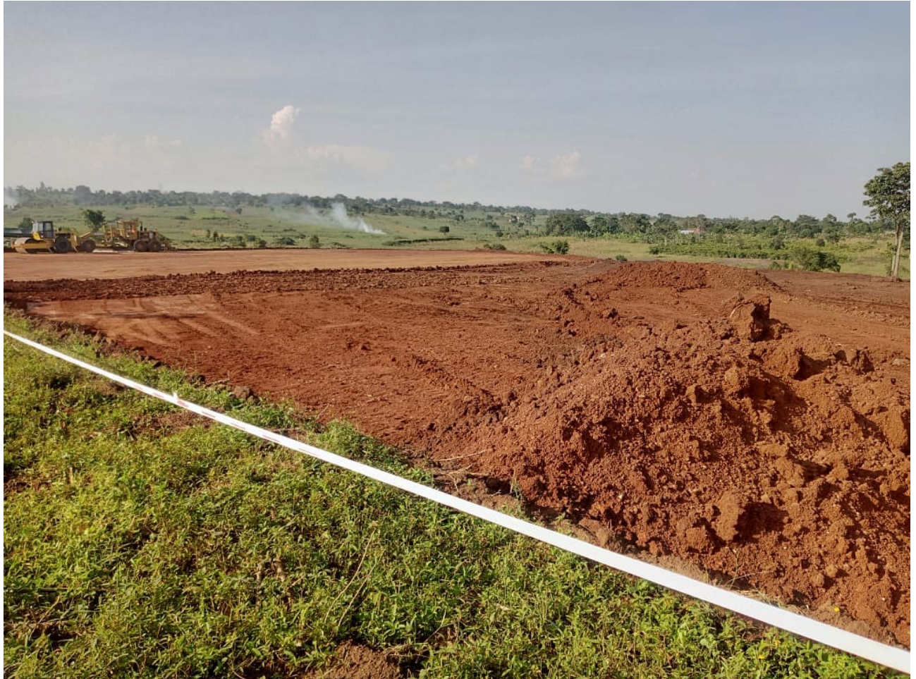
Figure 2: Removal of the topsoil layer across the Demonstration Plant facility area.