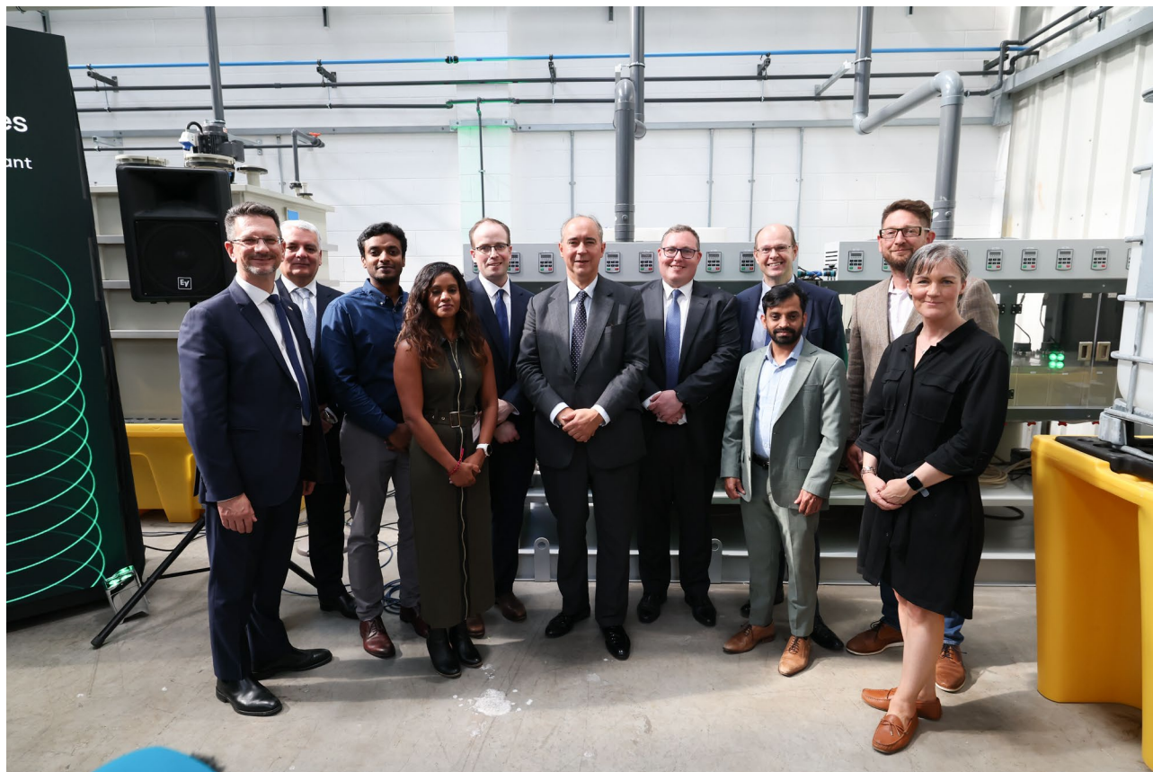
Figure 8: Representatives from the UK Government, Innovate UK, collaboration partners British Geological Survey (BGS), Ford, and Less Common Metals (LCM), Rare Earth Industry Association (REIA) joined IonicRE staff for the Ionic Technologies opening event.

An opening event for the Technical Facility established in Belfast was hosted in September 2023. Stakeholders from the UK Government and Northern Ireland attended the event, along with collaboration partners where the CLIMATES grants were officially announced.