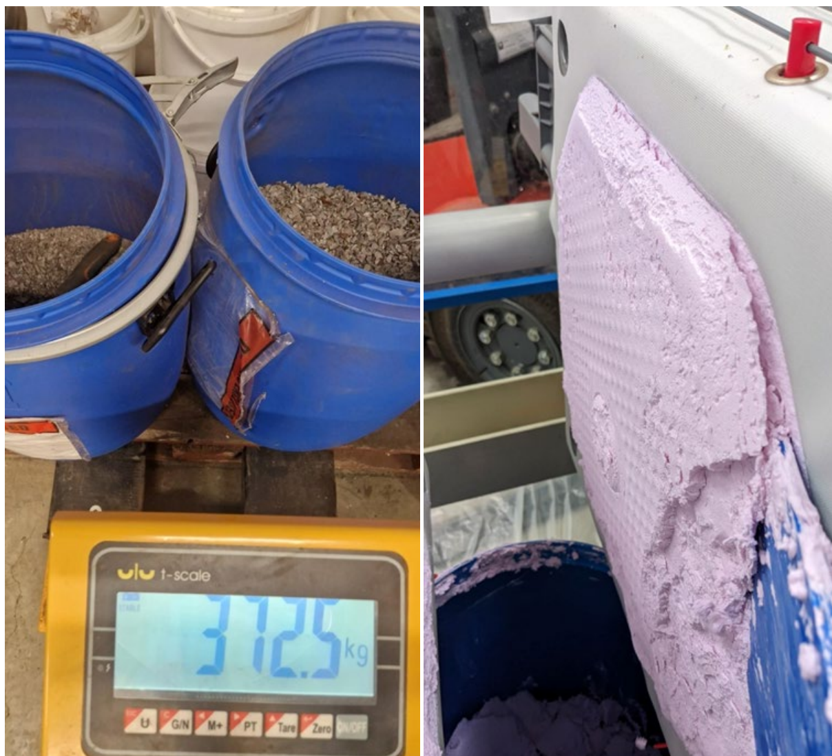
Figure 9: Left, crushed magnets prepared, and right, mixed rare earth filter cake prepared for downstream process commissioning activity.