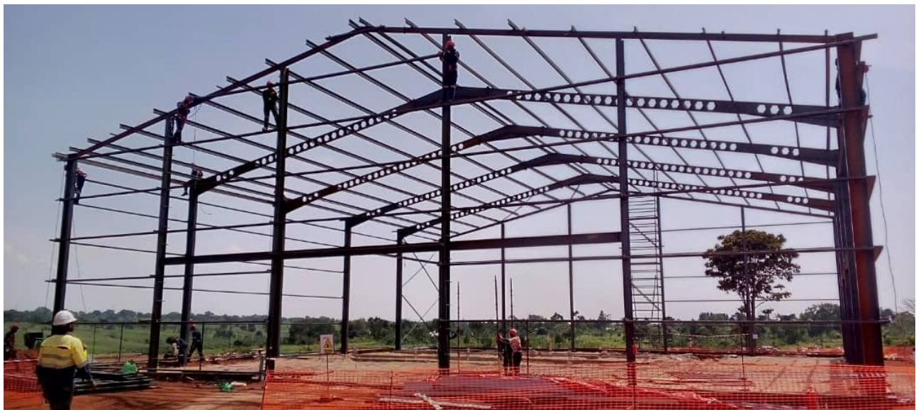
Figure 3: Makuutu Technical Facility frame structure erected.