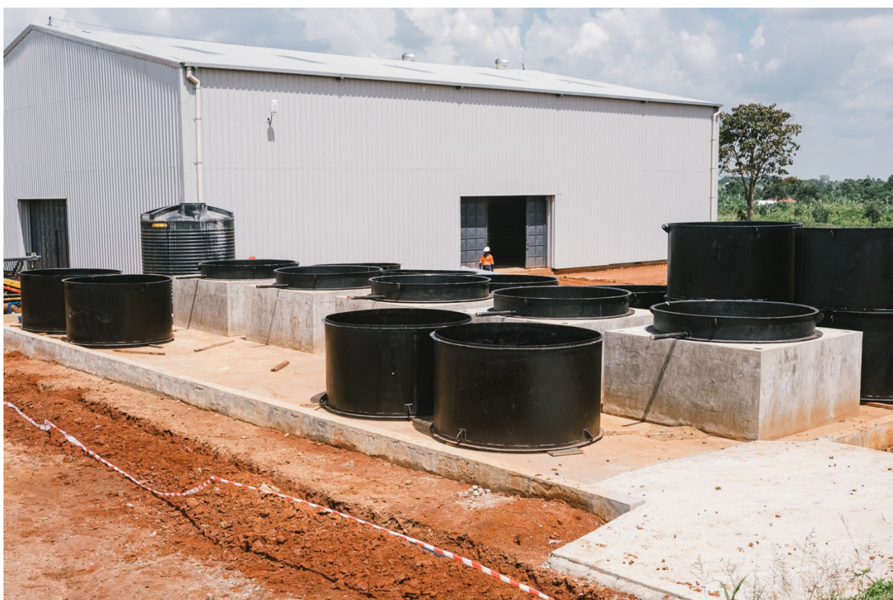
Figure 5: Crib shells which were being assembled for commissioning.