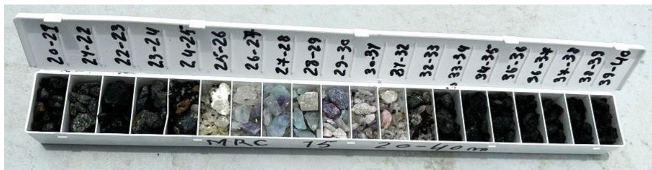
Figure 2: Chip-tray of 20m-40m interval of MRC15. 1

Fortunately, some of the intersections of spodumene-bearing pegmatite are quite distinctive (Figure 2) due to the presence of pale blue cleavelandite (e.g., the 27m-28m compartment of the chip tray in Figure 2), or traces of purple lepidolite (e.g., the 29m-30m compartment). Spodumene presents typically as elongate tabular or bladed fragments, e.g., in the 30m-31m compartment of the chip tray, but can also be “blocky” e.g., the large grey fragment in the 28m-29m compartment.