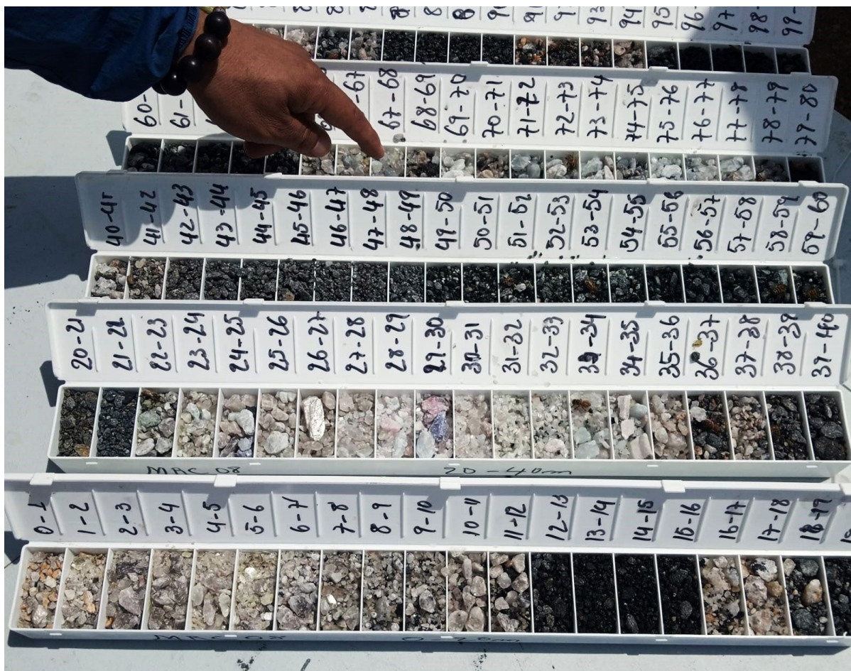
Figure 3: Multiple spodumene-bearing intersections attained by MRC08.

Spodumene is present in the interval from 0m-11m (1%-5% spodumene), 22m-36m (10%-20% spodumene, with distinct large fragment 26m-27m) and 66m-79m (5%-10% spodumene). Detailed composition of these intervals is provided in Appendix 3.