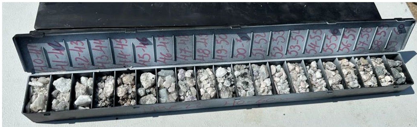
Figure 5: Chip-tray of 40m-60m interval of MRC22. The minerals present include spodumene (10%-20%), lepidolite (1%-5%), elbaite (1%-3%), cleavelandite (variety of albite feldspar, 20%-40%), microcline (variety of potassium feldspar, 5%-10%), muscovite (variety of mica, 5%-10%), and quartz (20%-30%).

The composition of the pegmatite at Muvero includes spodumene-rich zones in which the spodumene occurs mostly as phenocrystic megacrysts in a coarse-grained matrix comprised chiefly of cleavelandite and quartz, with accompanying varying minor amounts of lepidolite and elbaite, muscovite and microcline. However, RC drilling usually results in small fragments, and it can be difficult to recognise spodumene in this situation, but spodumene usually presents as elongate tabular or bladed fragments, e.g., well-displayed in the 28m-29m compartment of the chip tray in Figure 4, and the 40m-41m and 48m-49m compartments of the chip tray in Figure 5, and Figure 6.