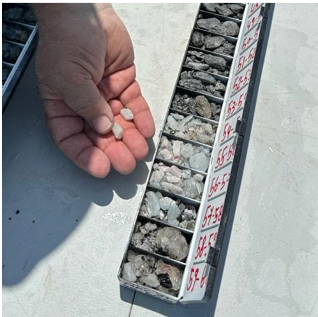
Figure 6: Close-up view clearly displaying spodumene fragments in the 55m-56m and 56m-57m compartments of the 40m – 60m chip-tray of MRC21, and in the hand. Note the mineralisation evident from 54m to 60m, which contains tabular fragments of spodumene (10%-20%), pale blue cleavelandite (variety of albite feldspar, 20%-40%), grey quartz (20%-30%), black tourmaline (1%-5%), microcline (variety of potassium feldspar, 5%-10%) and muscovite (variety of mica, 5%-10%).