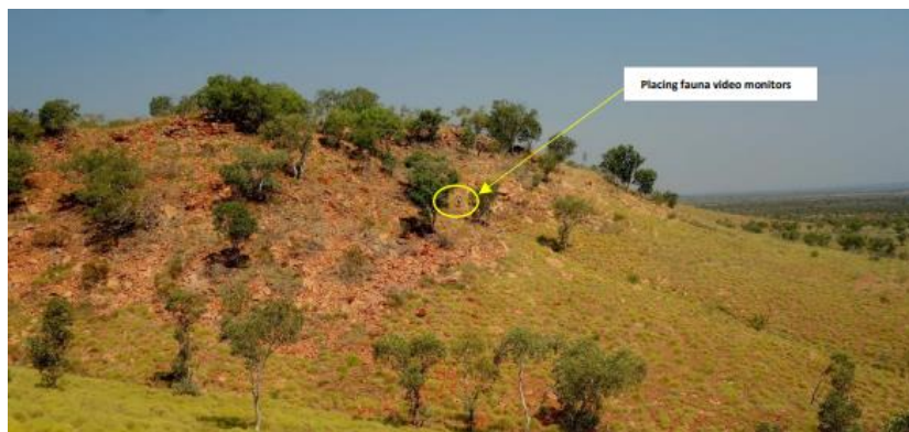
Figure 3: Placing of fauna video monitors

During the period the Company worked with the Heritage Survey team to complete extensive heritage baseline surveys. Ethnographic surveys for the development footprint were finalised and archaeological surveys of the expanded footprint were completed with the traditional owners of Browns Range, the Jaru People. In addition, flora, fauna and vegetation surveys were undertaken. These additional environmental baseline surveys are to accommodate footprint changes for road deviations and infrastructure additions. The amendments will be captured in a variation submission (Section 45C of the Environmental Protection Act) to the approved Ministerial Statement 986 for the Browns Range Project.