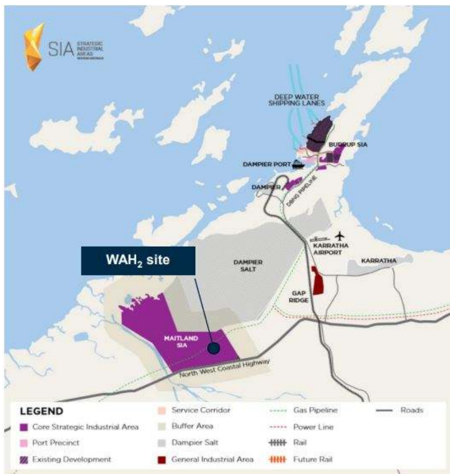
Figure 2 - The WAH 2 Project location within the Maitland Strategic Industrial Area (SIA)

During the period, the terms of the Option to Lease for the land allocated to Hexagon have been agreed in-principle with DevelopmentWA and approvals are being progressed.