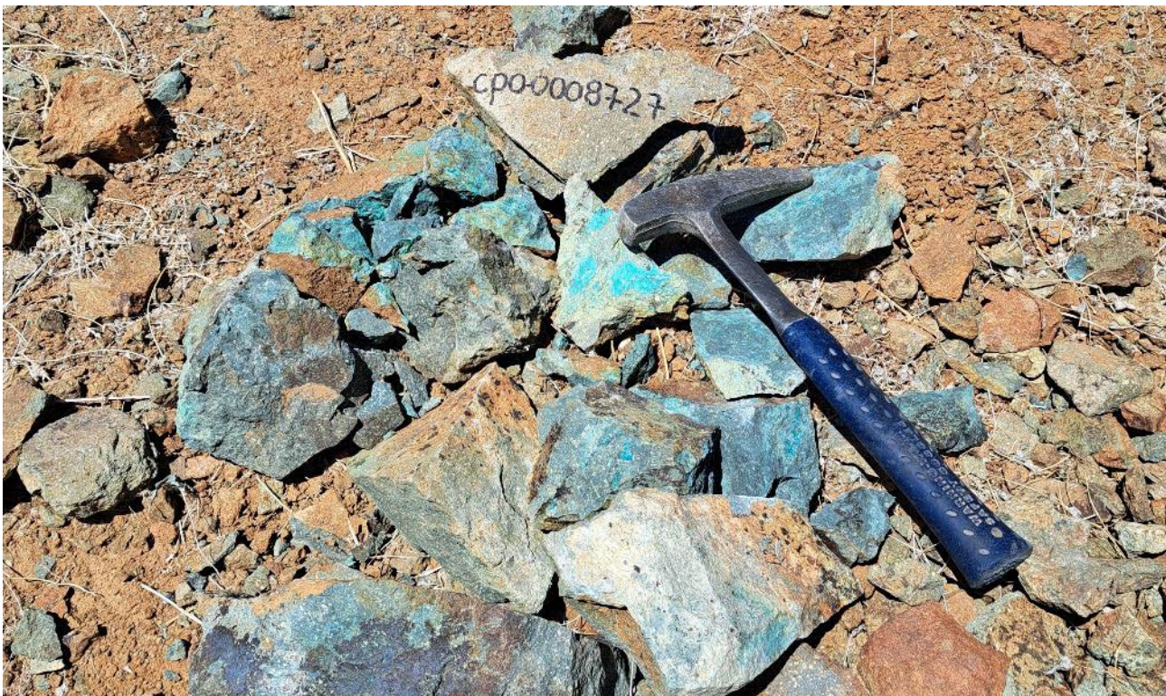
Figure 2: Shallow high-grade copper and gold from sample CPO0008727 with 2.02% Cu returned at El Quillay East.

Confirmatory sampling was also completed at El Quillay Central where assay results returned grades up to 1.88% Cu and gold mineralisation of up to 2.20g/t Au (refer Table 2).