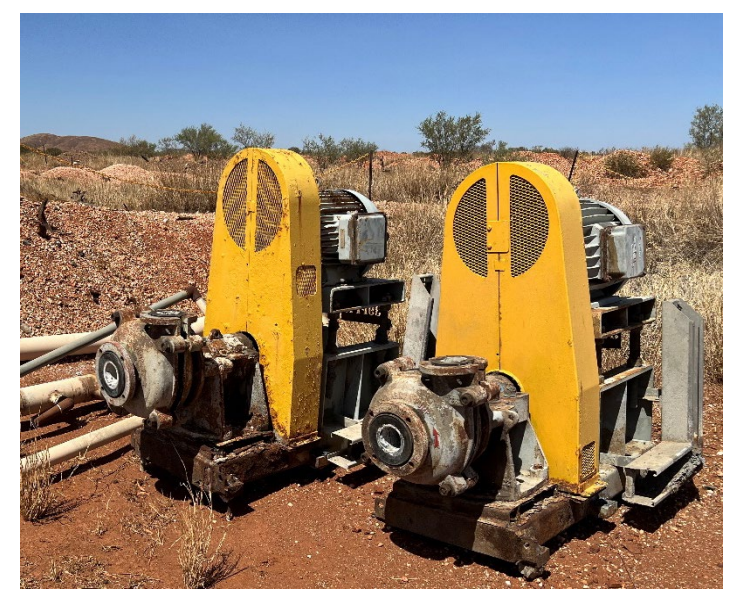
Figure 8 - Removed and successfully rebuilt process water pumps