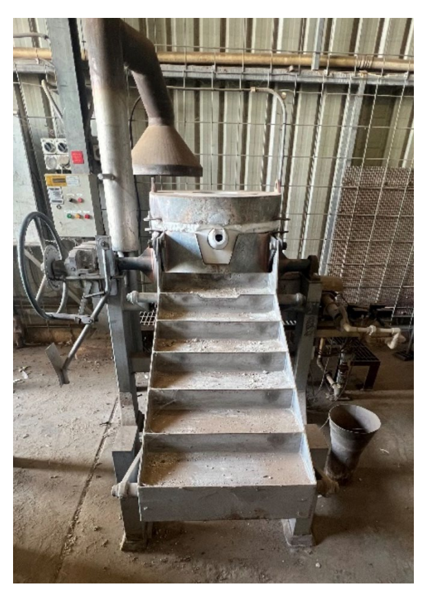
Figure 4 – Furnace replaced complete with new spout & crucible