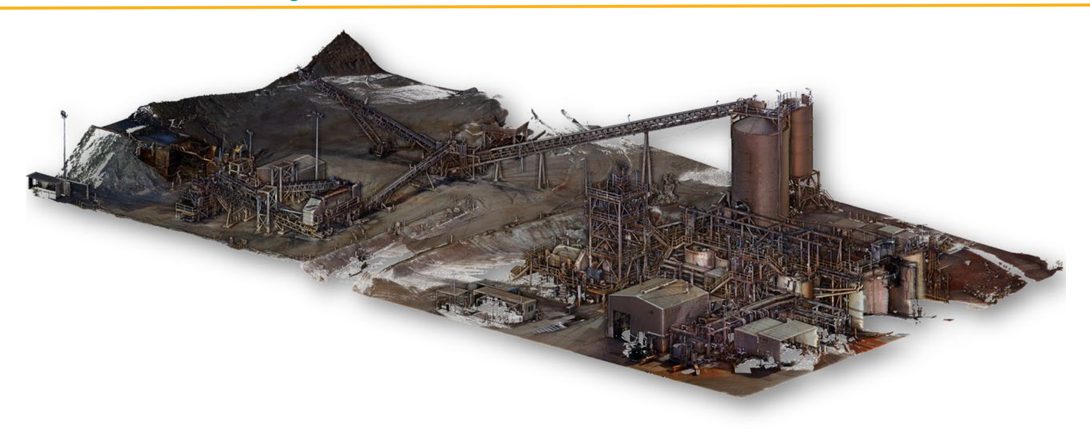
Figure 10: 3D scan of entire processing facility completed February 2024