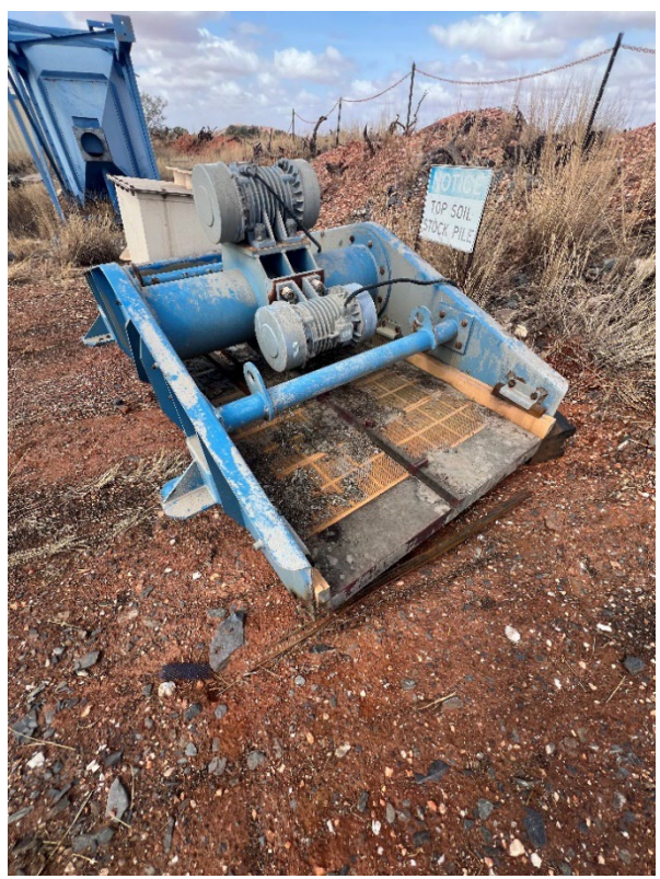
Figure 7 – Tailing Screen removed to replace the underpan