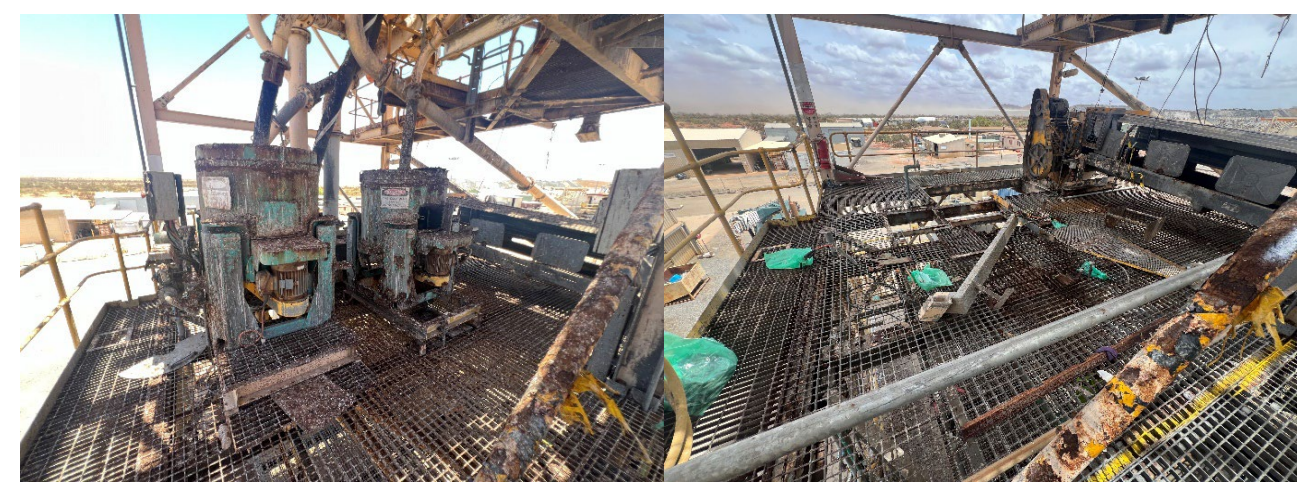
Figure 1 - Knelsons (x2) and associated pipework removed (before & after) facilitating the ready installation of the 2 new Knelson concentrators upon arrival.

Black Cat's Managing Director, Gareth Solly, said: "Our refurbishment activity is progressing well with planned activity ahead of schedule and significant upside observed throughout the facility with lower than anticipated refurbishment required in certain areas.