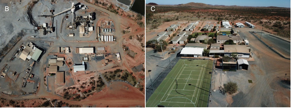
Figure 2:A. Schematic isometric long-section looking towards the north showing >2.7km of known mineralisation comprised of: Main Zone (~1Moz mined @ 1,000oz per vertical metre), under-drilled Eastern Zone, unmined Footwall Gabbro Zone and the Paulsens Repeat seismic target; 2B. Aerial view of Paulsens processing facility and site offices; and 2C. Paulsens village and camp.