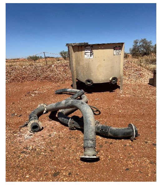
Figure 9 – Removed pre-leach thickener hopper to be re-lined