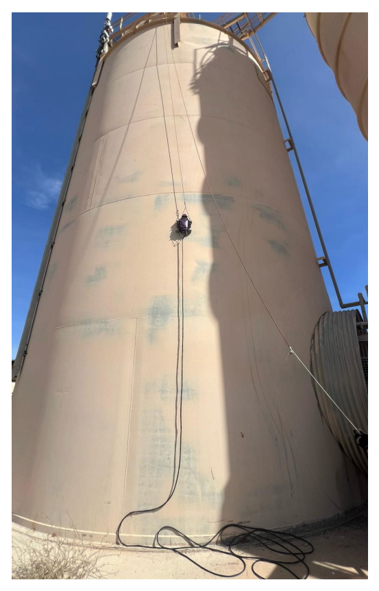
Figure 3- Thickness testing on the fine ore bin completed and showing better than anticipated results

Photographs from February 2024 refurbishment activities: