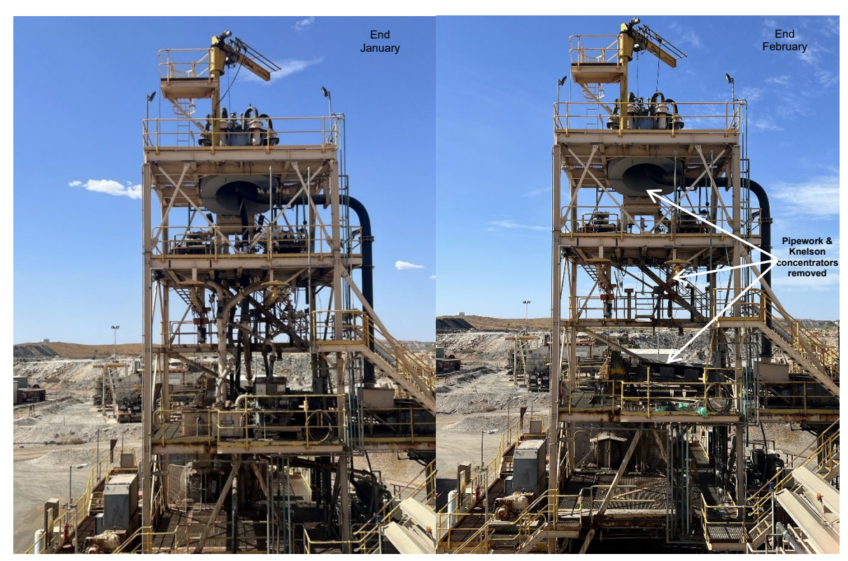
Figure 5 – Knelson concentrators along with cyclone underflow and mill feed pipework removed. Pipework will be rubber lined.