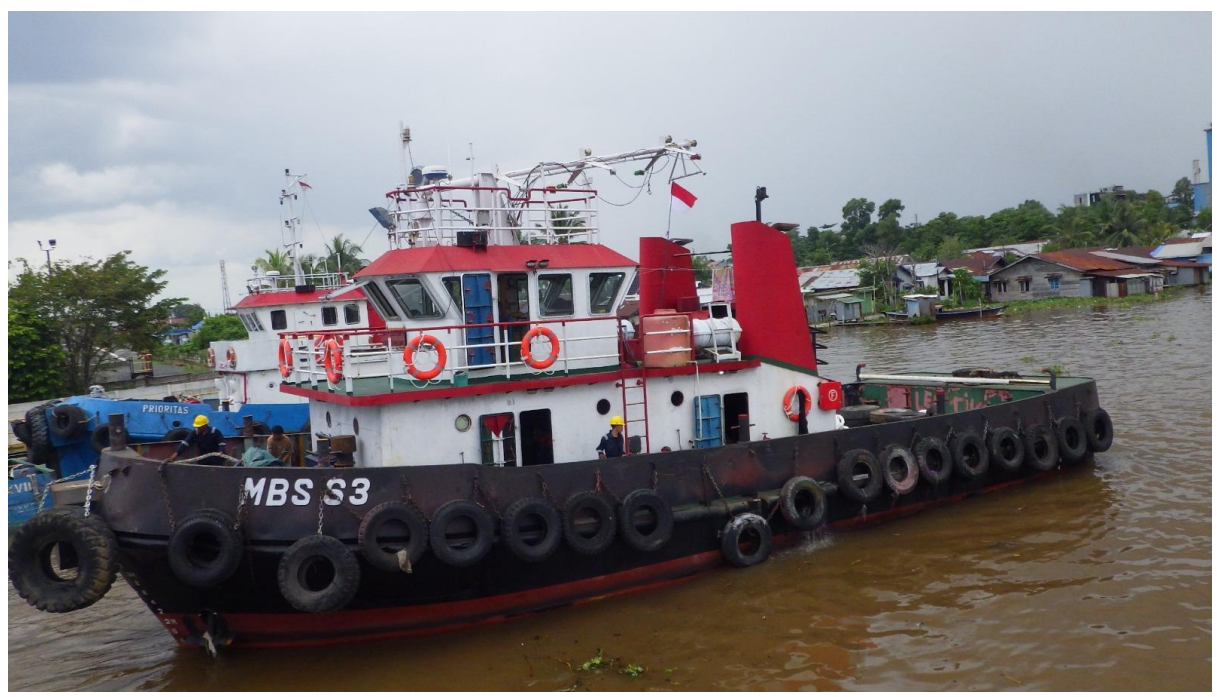
MBS 63 Enroute from Banjarmasin to Batu Tuhup Jetty