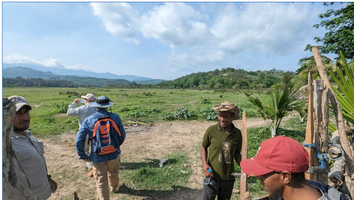
Figure 4: The in-country team accessing ESR-RP-04 during field reconnaissance in January 2024. The picture was taken looking south-east towards ESR-RP-06

The additional RP's are 100% owned by Estrella and do not currently form part of the MRT joint-venture which applies to the EL's only.