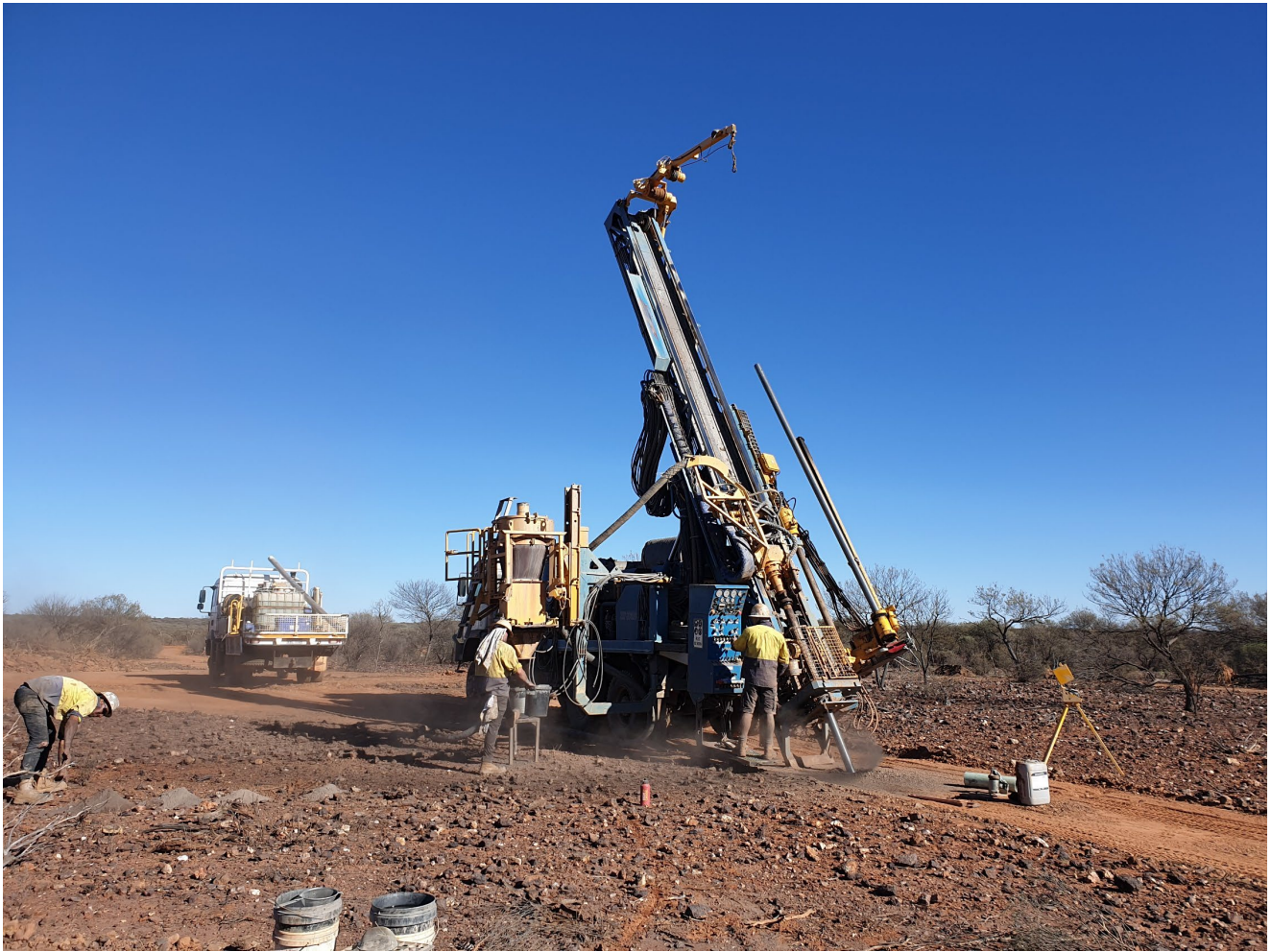
Figure 3. AC drilling underway at Sandstone North prospect, Sandstone Gold Project.