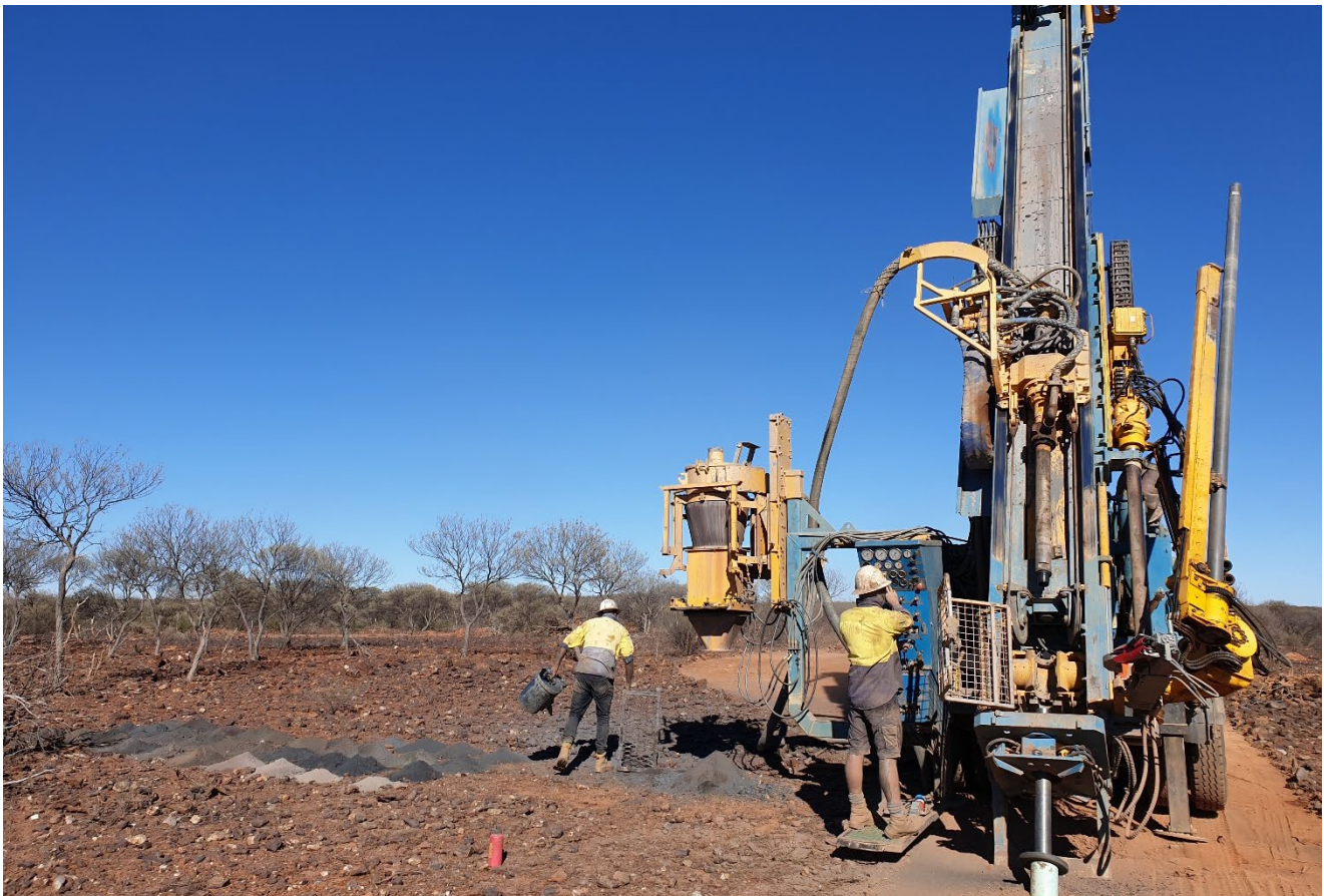
Figure 1. AC drilling underway at Sandstone North prospect, Sandstone Gold Project.