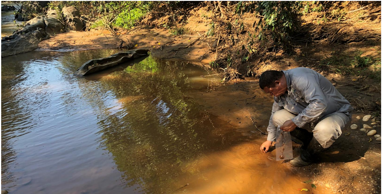
Figure 2: Minas Novas stream sediment sampling