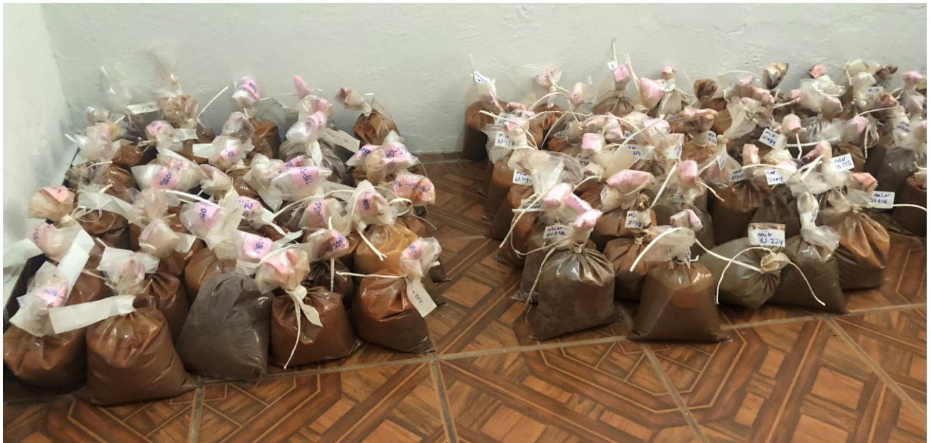
Figure 3: Minas Novas stream sediment samples ready to be dispatched for analysis