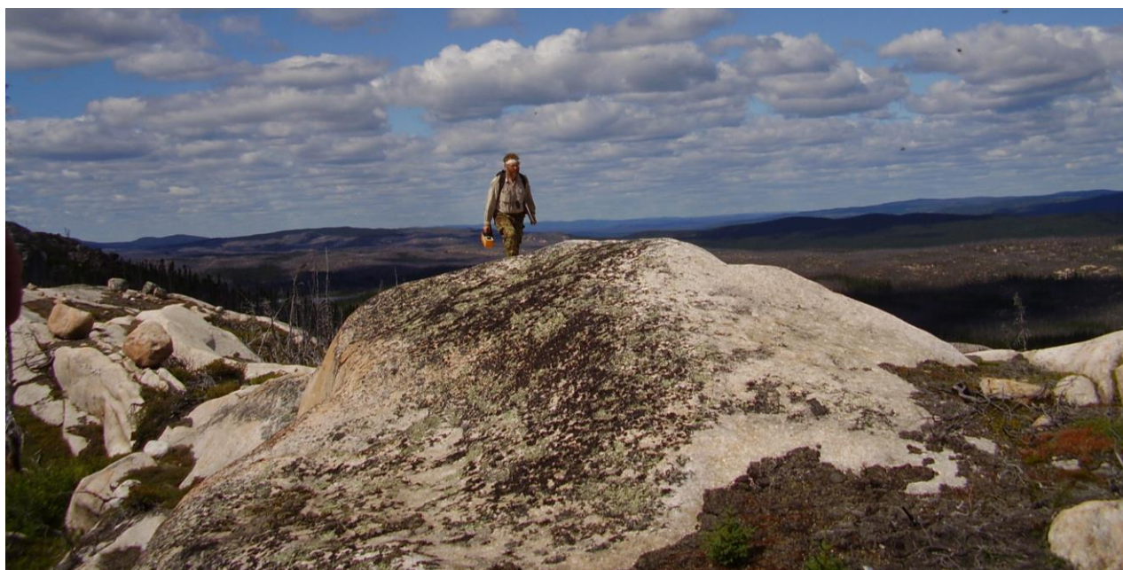
Figure 2. Geologist in the field at the Harrier Uranium Project.

The Company will potentially be able to obtain access to flow-through financing in Canada to fund future exploration activities at the Harrier Project.